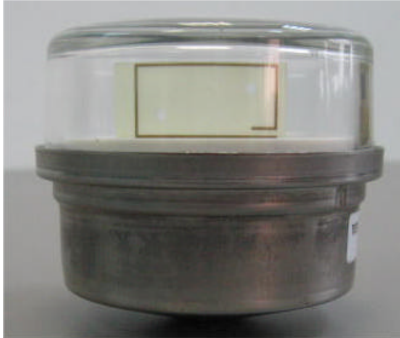
Photograph No.1 DTMW LCD water reader side view