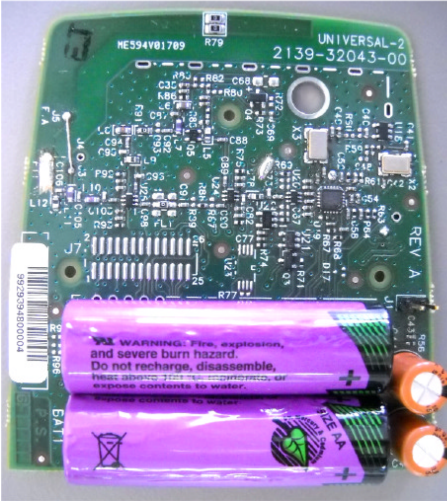
Photograph No.1 Water meter "Universal 2" PCB top view