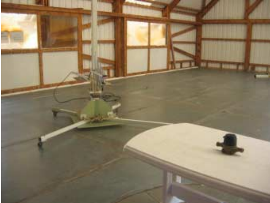
Photograph No.1 Setup for carrier field strength measurements at the OATS