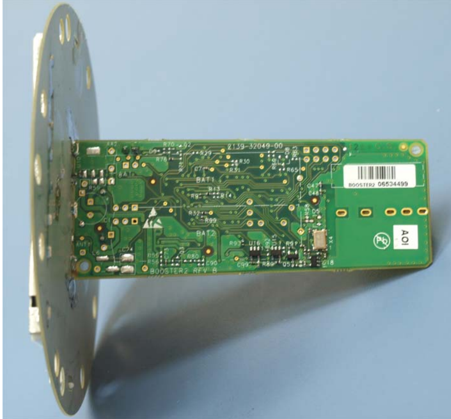
Photograph No.6 PCB second side view