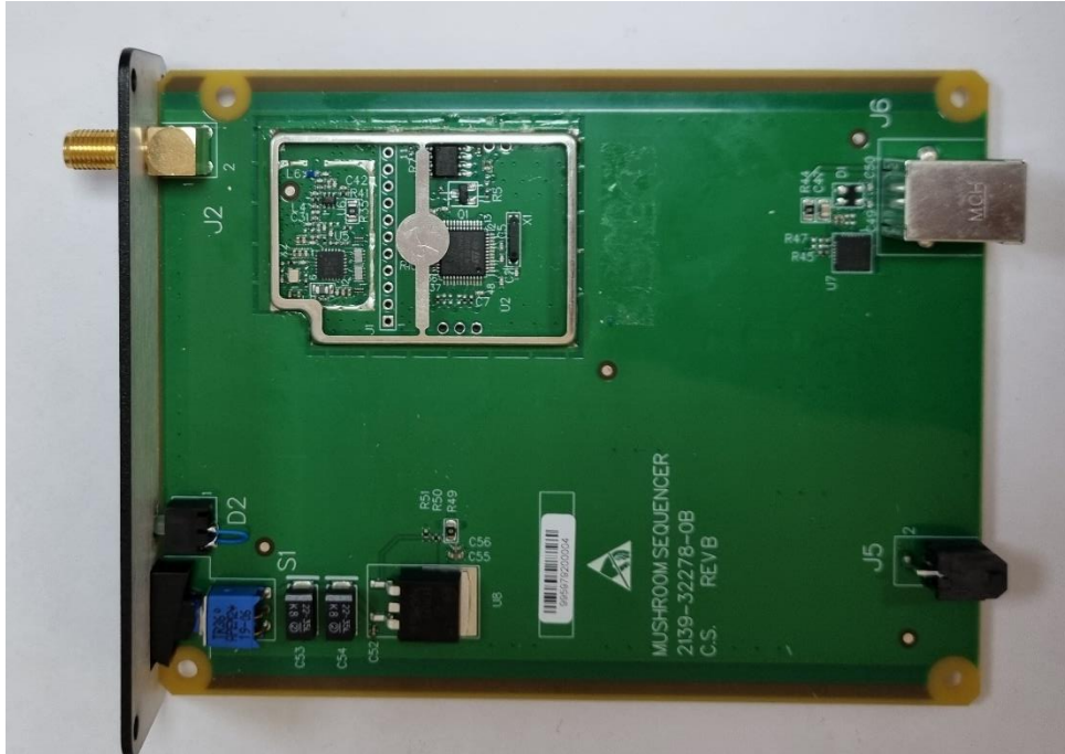
PCB Top without shield