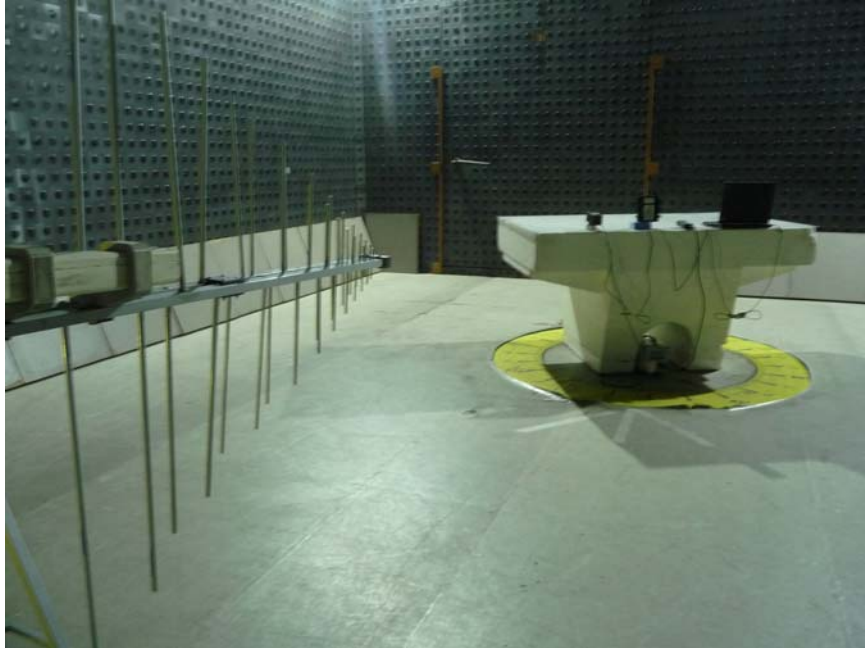
Photograph No.1 Setup for carrier power, spurious emissions field strength and 6 dB OBW measurements in the anechoic chamber from 30 to 1000 MHz