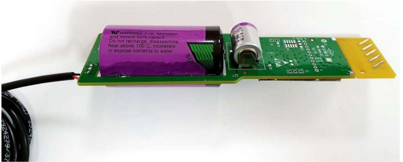
Photograph No.1 MIU1USLA meter interface unit internal view