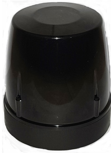
Figure 2 - LCU NEMA Enclosure