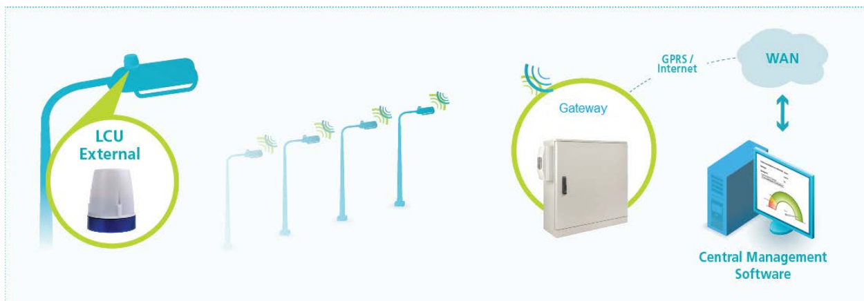
Figure 1 – System Topology

CMS usually contains a database of static and dynamic LCU information: ambient light values, lighting and dimming schedules, power usage, status, etc.