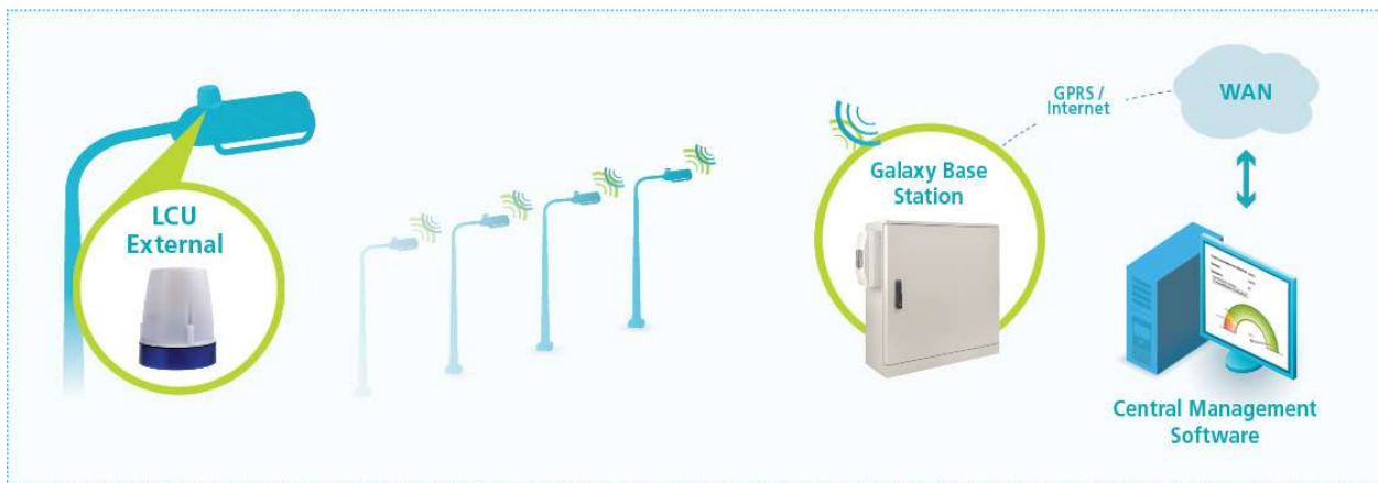
Figure 2 – System Topology

LCU NEMA with antenna connector for external antenna.