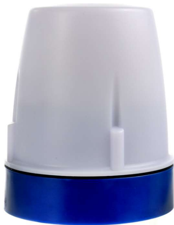
LCU NEMA (Internal antenna)