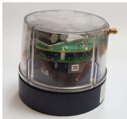
LCU NEMA (External antenna)