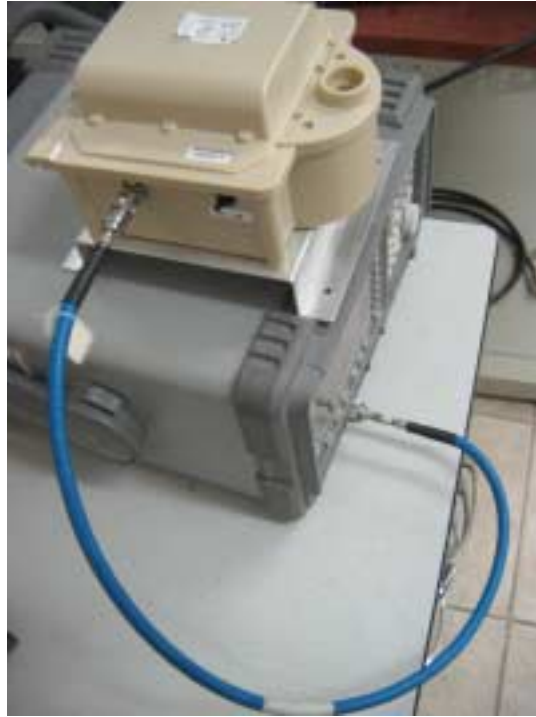
Photograph No.1 Output power, power density, conducted spurious emissions and the 6 dB occupied bandwidth measurement setup