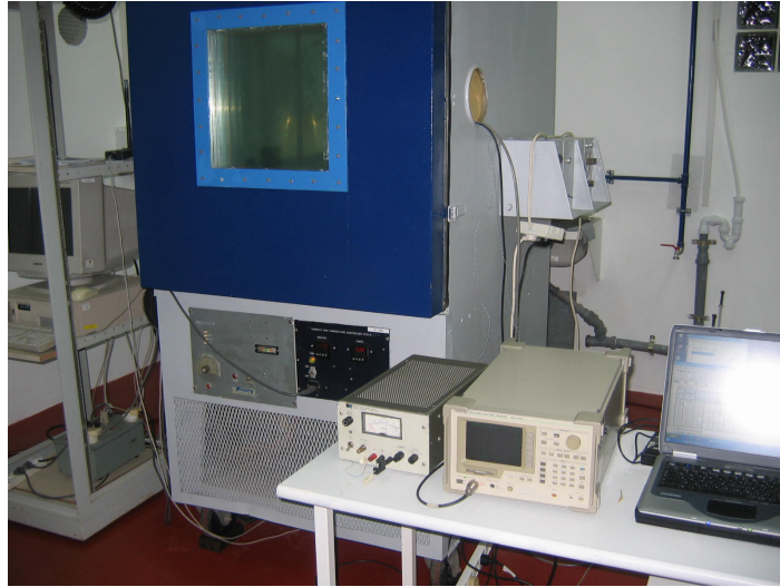
Photograph No.10 Frequency stability test setup