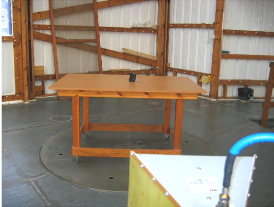
Photograph No.1 Output power, field strength and the 6 dB occupied bandwidth measurement setup