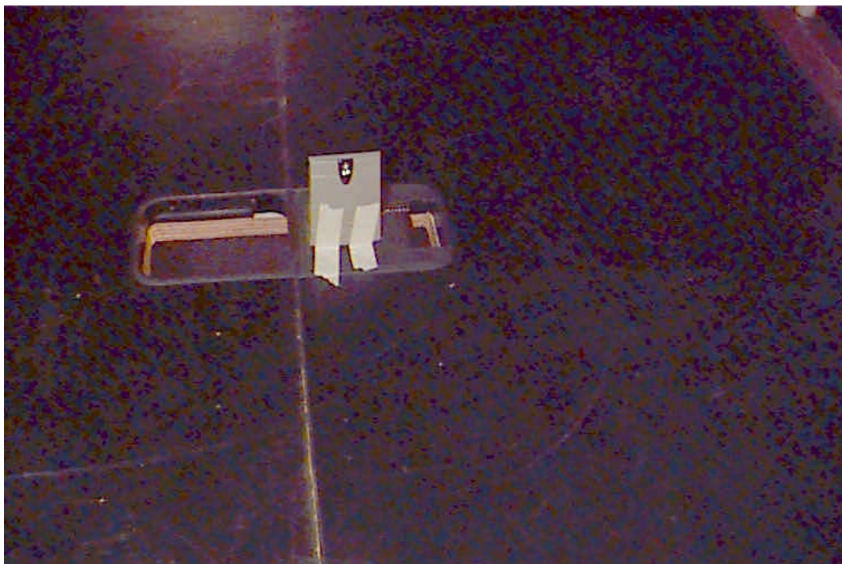
Photograph No.1 EUT configuration