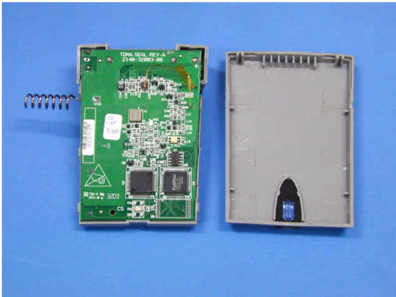
Photograph No.1 FP100SA 915 electronic seal Internal view