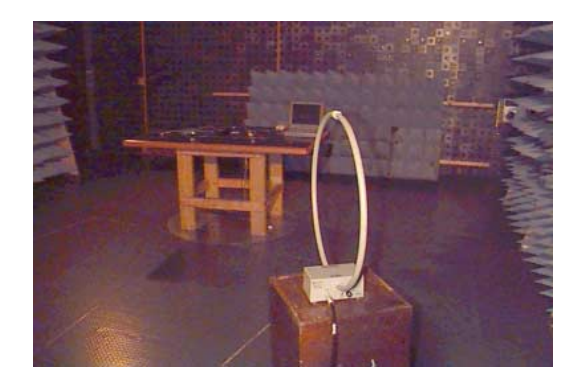
Photograph No.1 Radiated emissions measurement setup in the anechoic chamber with loop antenna