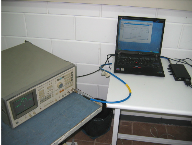
Photograph No.1 Output power, power density, conducted spurious emissions and the 6 dB occupied bandwidth measurement setup