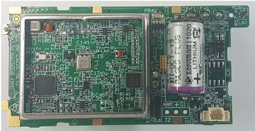
RF card - top view without shield