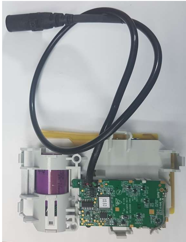
Assembly without plastic cover/ with data cable