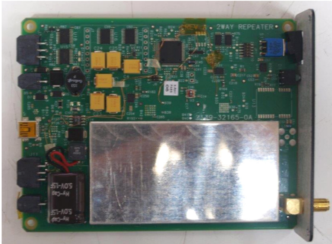
Photograph No.1 Allegro Repeater internal view