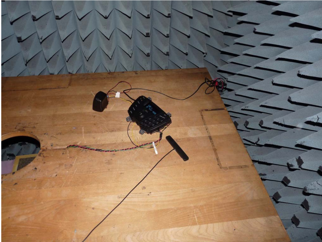
Photo 1: Test setup for radiated measurements (Enclosure, below 30 MHz, intentional radiator §15)