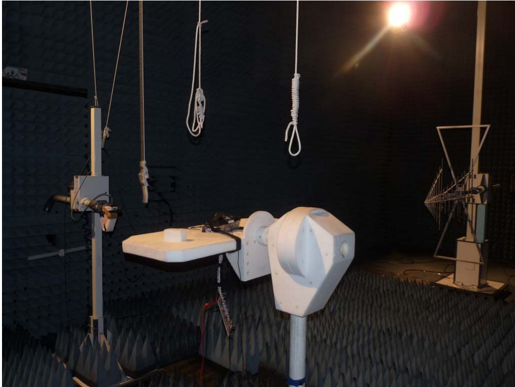
Photo 4: Test setup for radiated measurements (Enclosure, fully-anechoic chamber, 18-25 GHz, intentional radiator § 15)