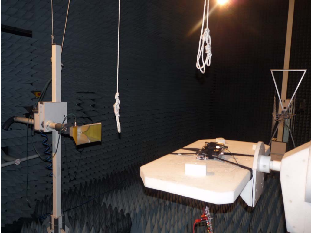
Photo 3: Test setup for radiated measurements (Enclosure, fully-anechoic chamber, 1-18 GHz intentional radiator §15 / 30 MHz – 10/20 GHz §22/24/27)