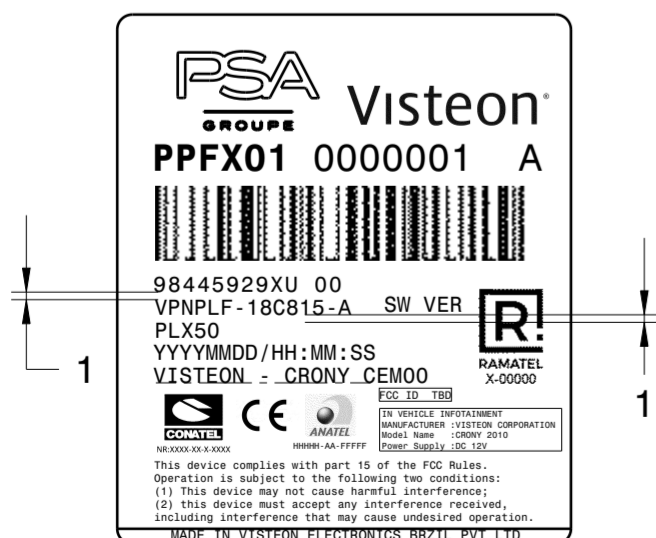
FOR REFERENCE PRINTED EI LABEL (AT VISTEON PLANT)