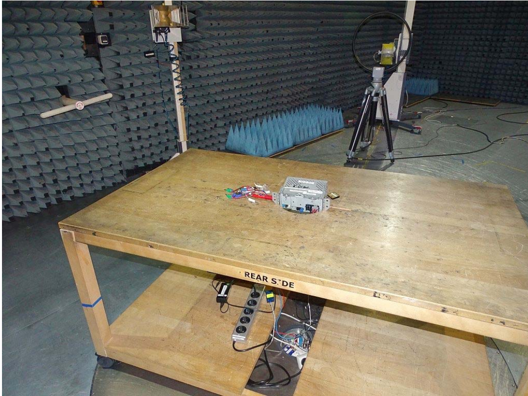
Photo 1: Test setup for radiated measurements (Enclosure, below 30 MHz, intentional radiator §15, ANSI C63.10)