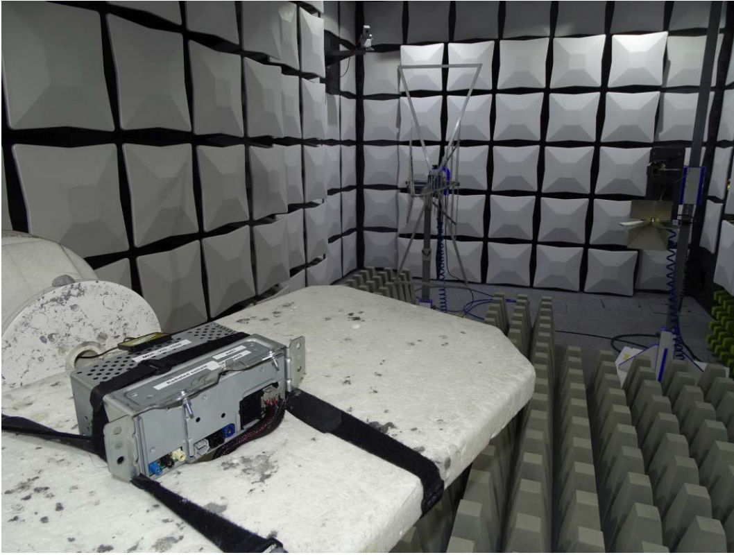
Photo 3: Test setup for radiated measurements (Enclosure, fully-anechoic chamber, 1-25 GHz intentional radiator §15, ANSI C63.10)