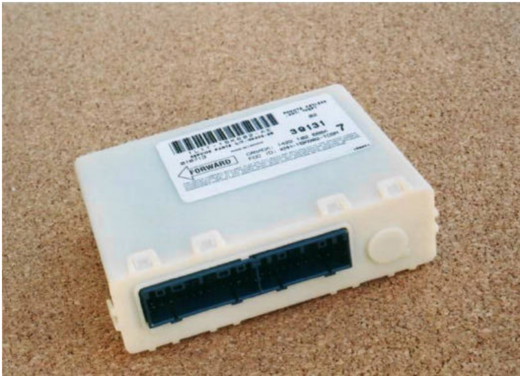
Exterior of the DUT; PN: 1L1T-15K602-AE