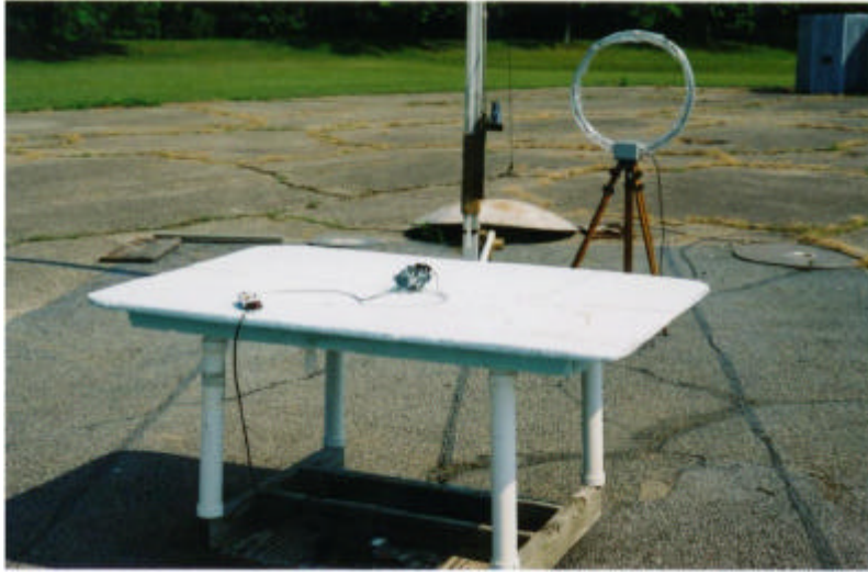
Mazda J56 / Ford U222/U228 on OATS