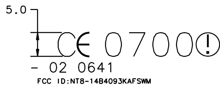
DETAIL C SCALE 2:1

POLY. SUBSTRATE POLY. LINER ADHESIVE BASE LINER