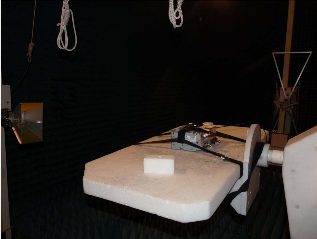
Photo 3: Test setup for radiated measurements (Enclosure, fully-anechoic chamber, 1-18 GHz intentional radiator §15 / 30 MHz – 10/20 GHz §22/24/27)