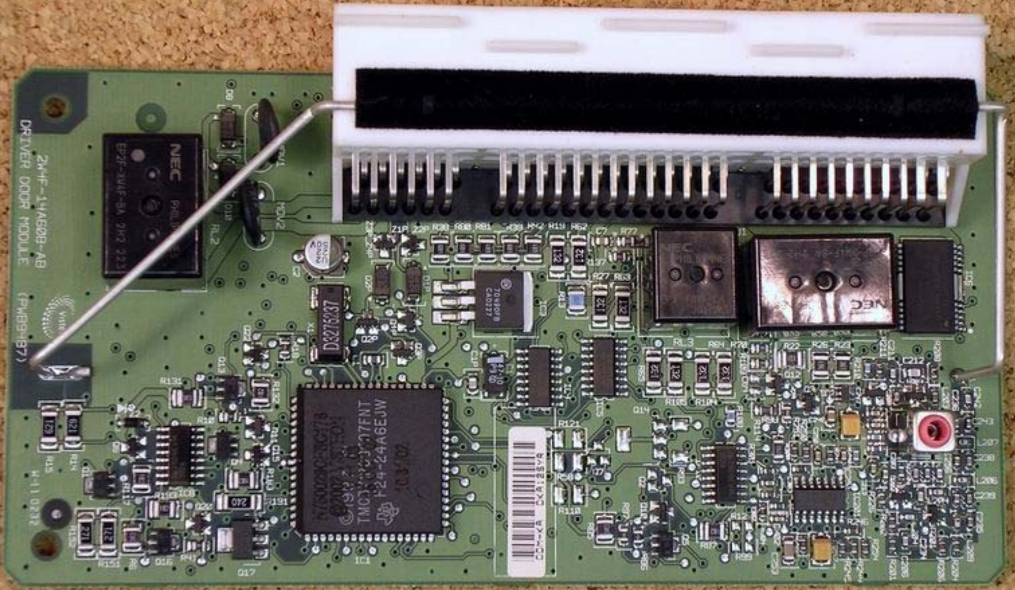
PCB Top View