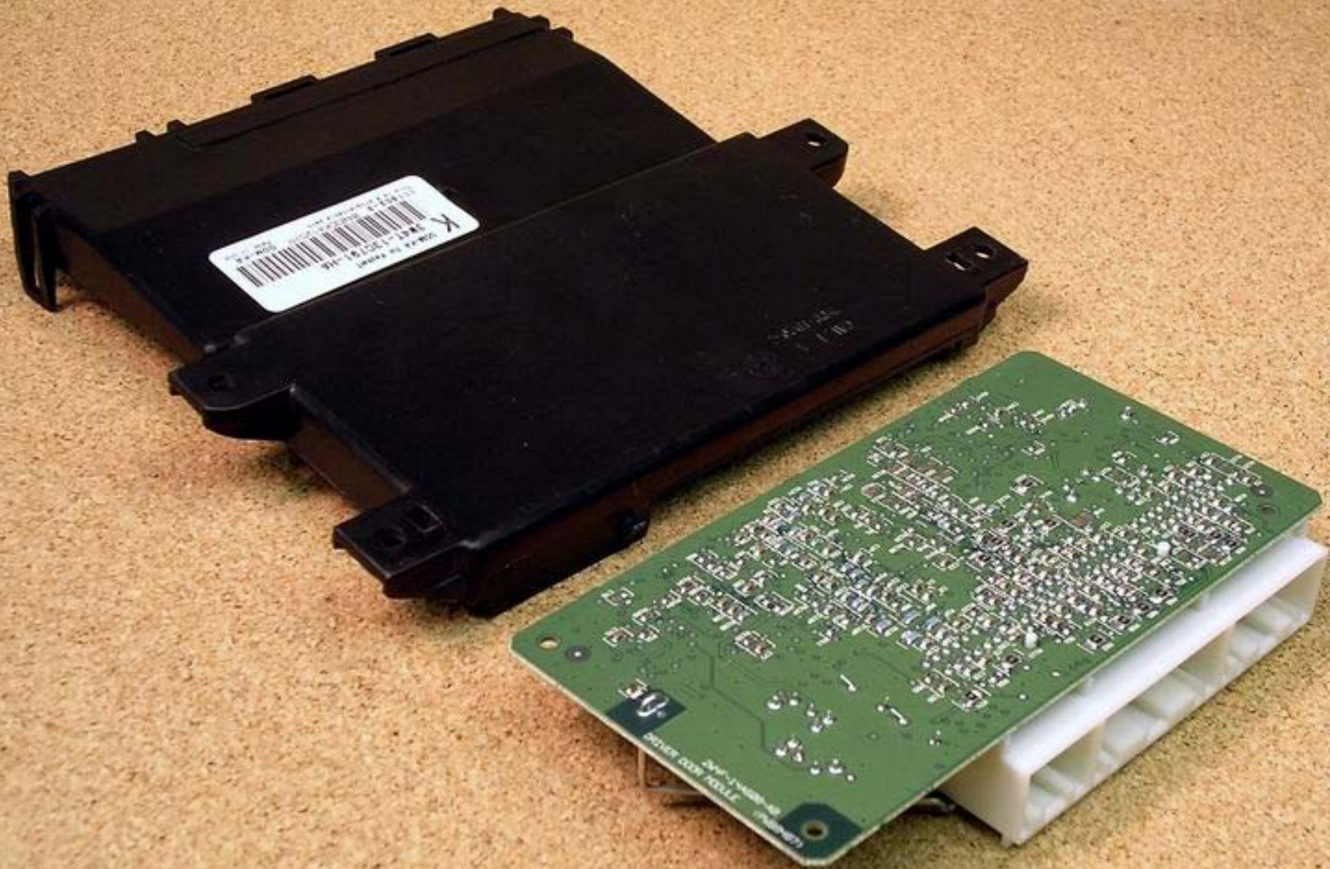
Case Apart Bottom