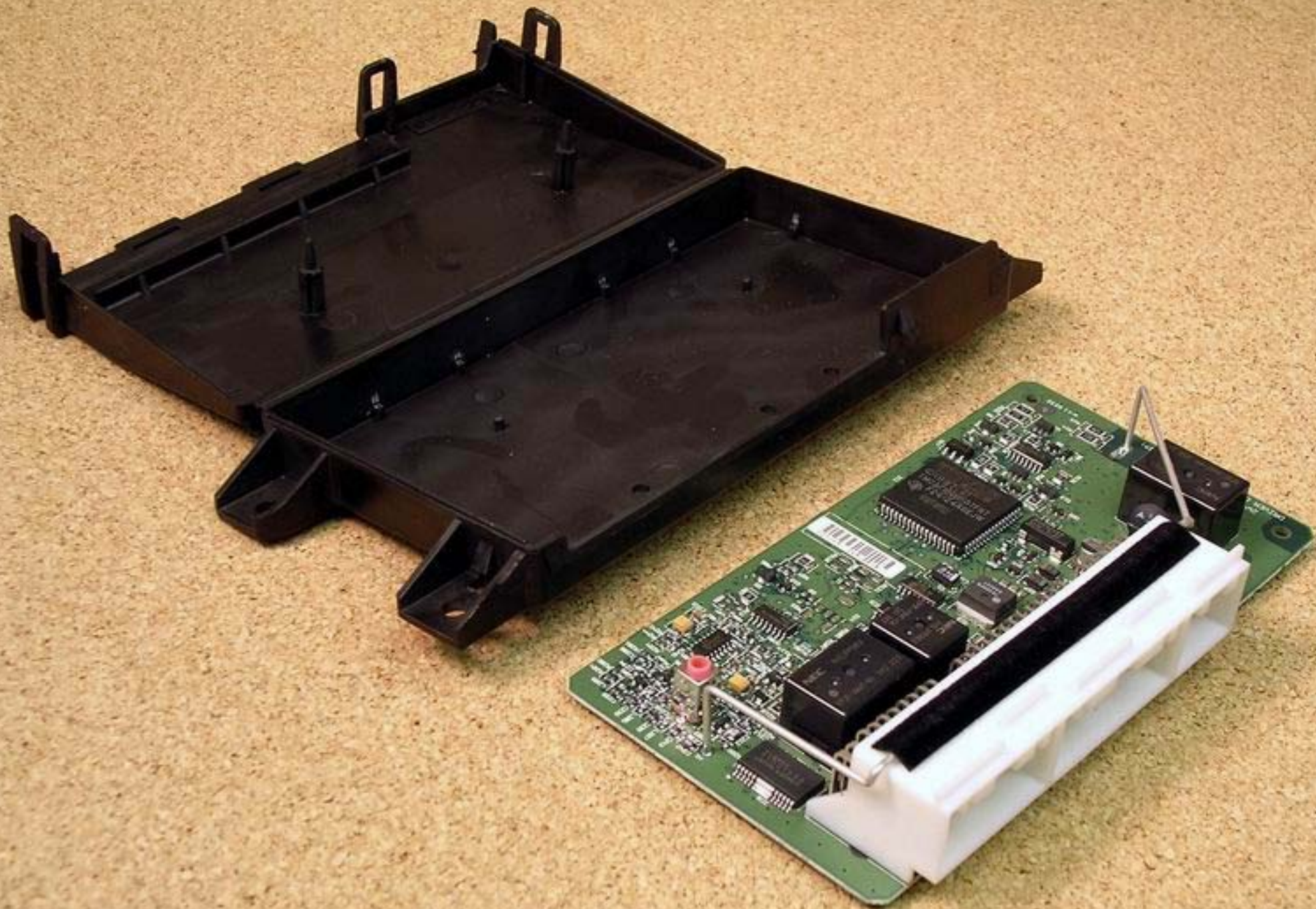
Case Apart Top