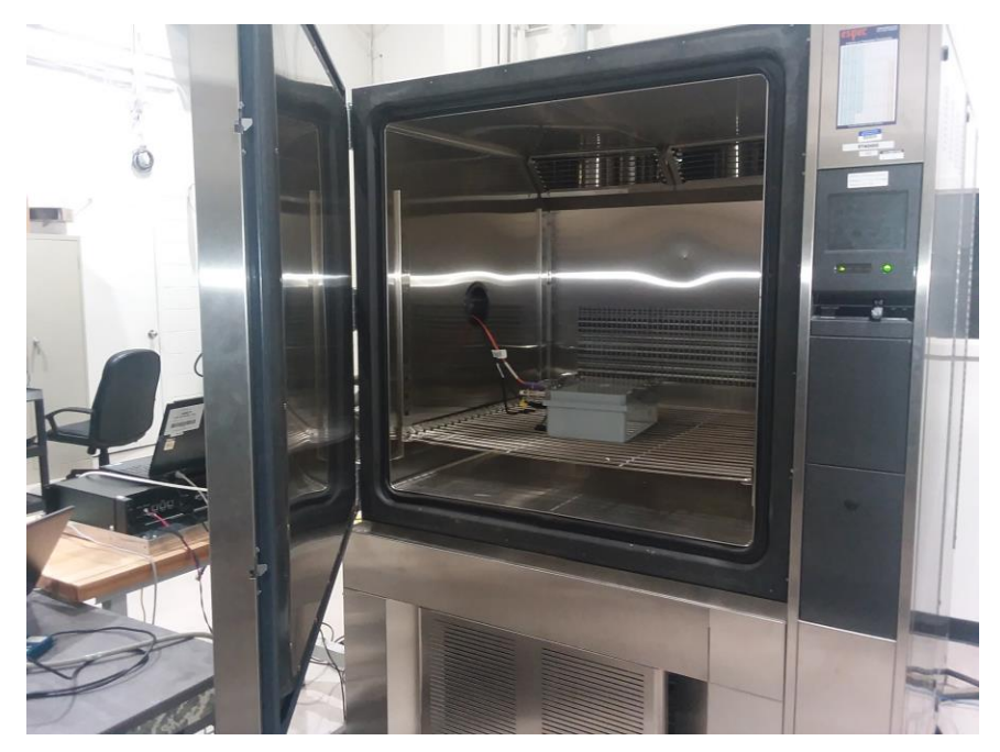
Figure 1: Frequency Stability, Setup Photo