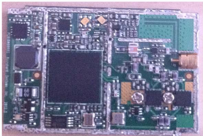
Top no Shield