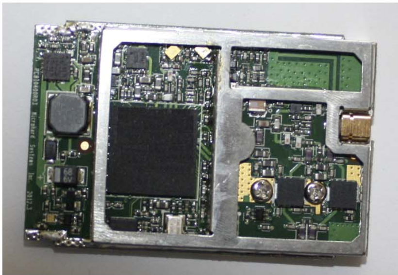
Top cover off