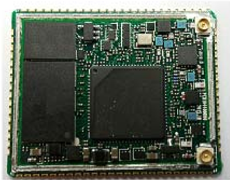
Top No Shield