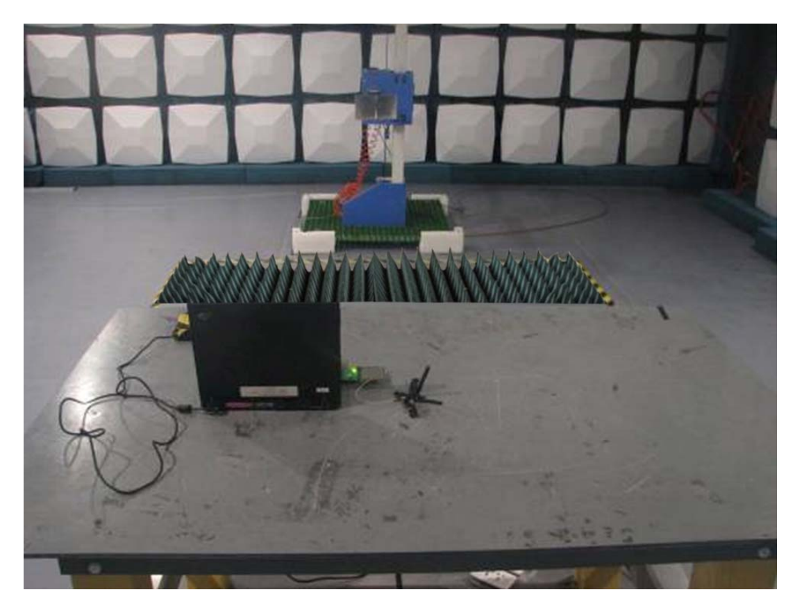
Page 2 This report shall not be reproduced except in full, without the written approval of Compliance Certification Services.