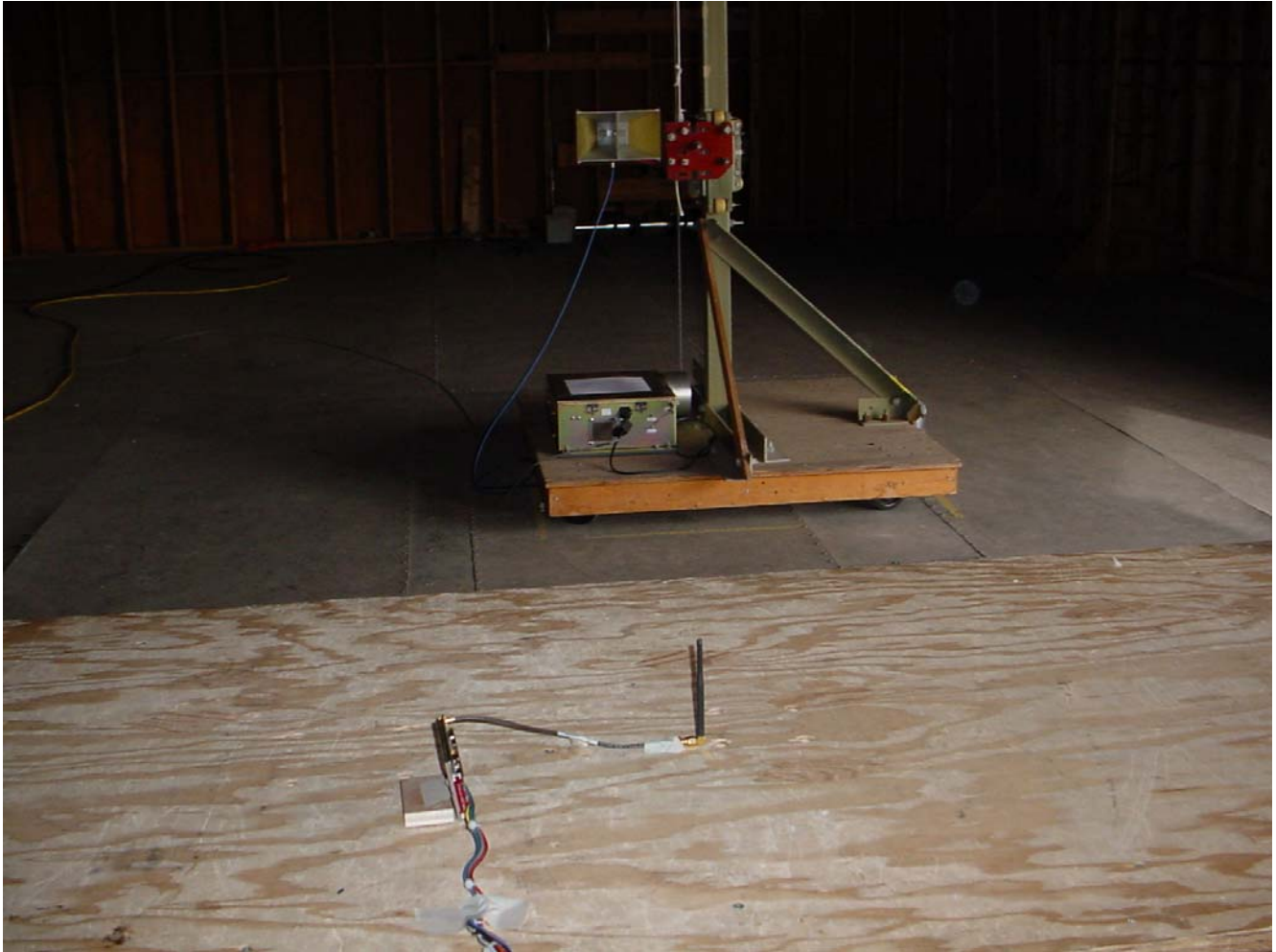
Radiated Emissions @ 3 Meters EUT with Quarter Wave Antenna, 1.5 dBi Gain

Microhard Systems Inc. 900 MHz OEM Frequency Hopping Module, Model MHX910A FCC ID: NS904P11 IC: 3143A-04P11