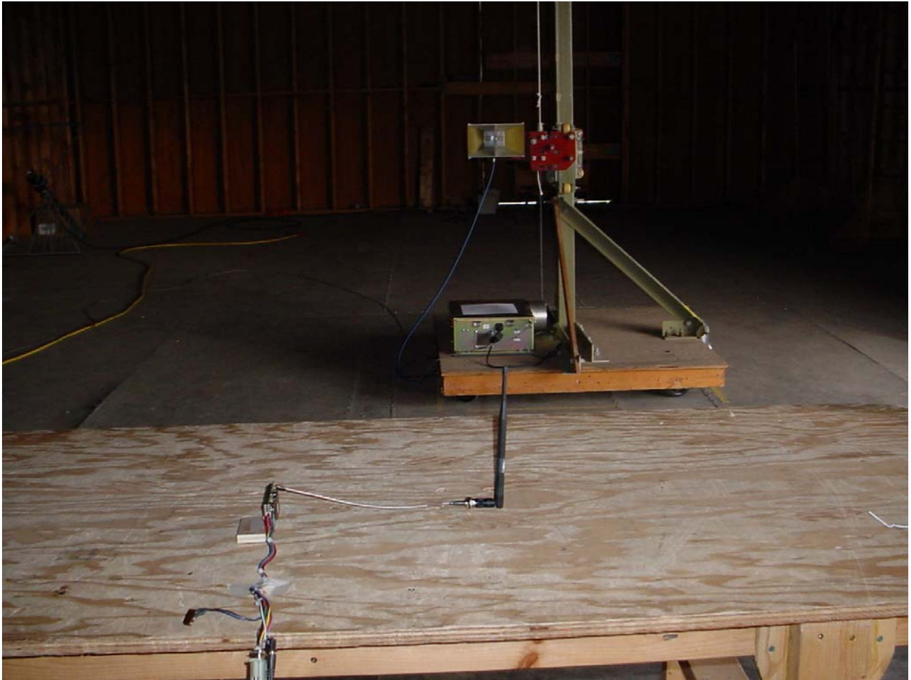
Radiated Emissions @ 3 Meters EUT with Rubber Ducky Antenna, 2 dBi Gain

Microhard Systems Inc. 900 MHz OEM Frequency Hopping Module, Model MHX910A FCC ID: NS904P11 IC: 3143A-04P11