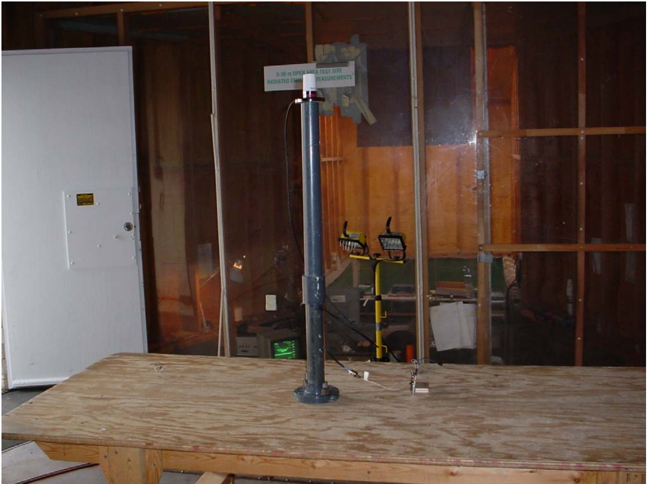
Radiated Emissions @ 3 Meters EUT with Transit Antenna, 5.15 dBi Gain

Microhard Systems Inc. 900 MHz OEM Frequency Hopping Module, Model MHX910A FCC ID: NS904P11 IC: 3143A-04P11