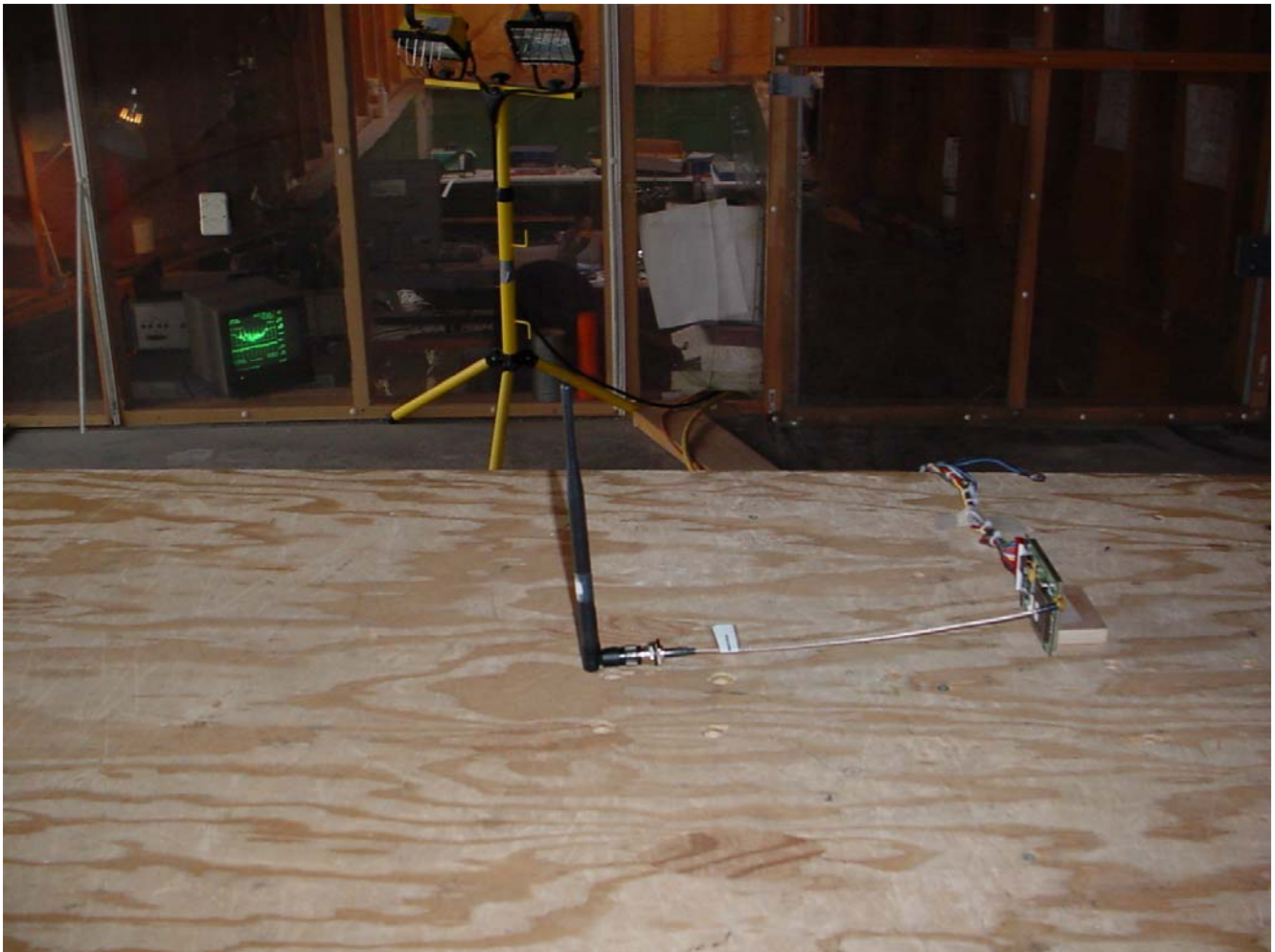
Radiated Emissions @ 3 Meters EUT with Rubber Ducky Antenna, 2 dBi Gain