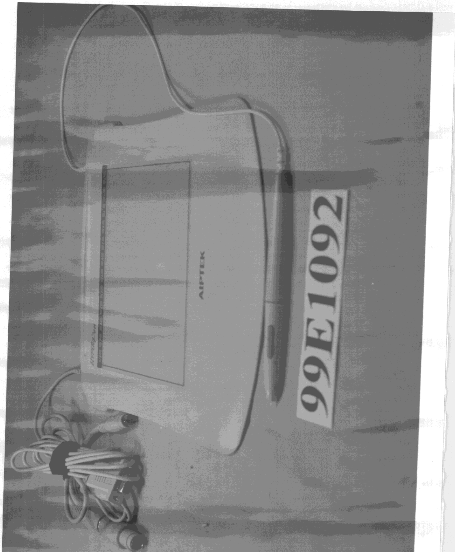
1. Photo # 1. Front View