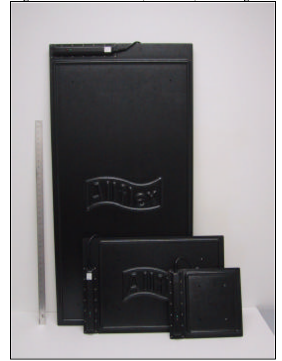
Figure 1 - Allflex Small, Medium, and Large Panel Readers

This instruction guide provides the user/installer with information about mechanical installation, electrical wiring, configuration, operation, and performance characteristics of the Panel Readers. The 3 Panel Readers described in this manual are identical in all respects except for physical size and consequential performance attributes of identification tag reading distance and reading zone. Additional technical information is contained in companion documents, including (a) the Allflex Panel Reader Configurator® User Guide, (b) the Allflex Panel Reader User Technical Reference, and (c) the Allflex Panel Reader Serial Communications Command Language.