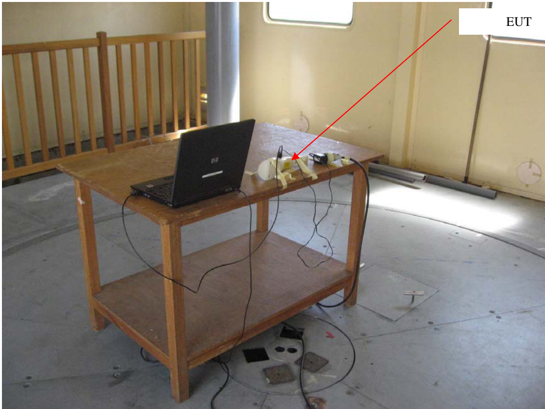
Antenna in front of the equipment with turntable at 0°