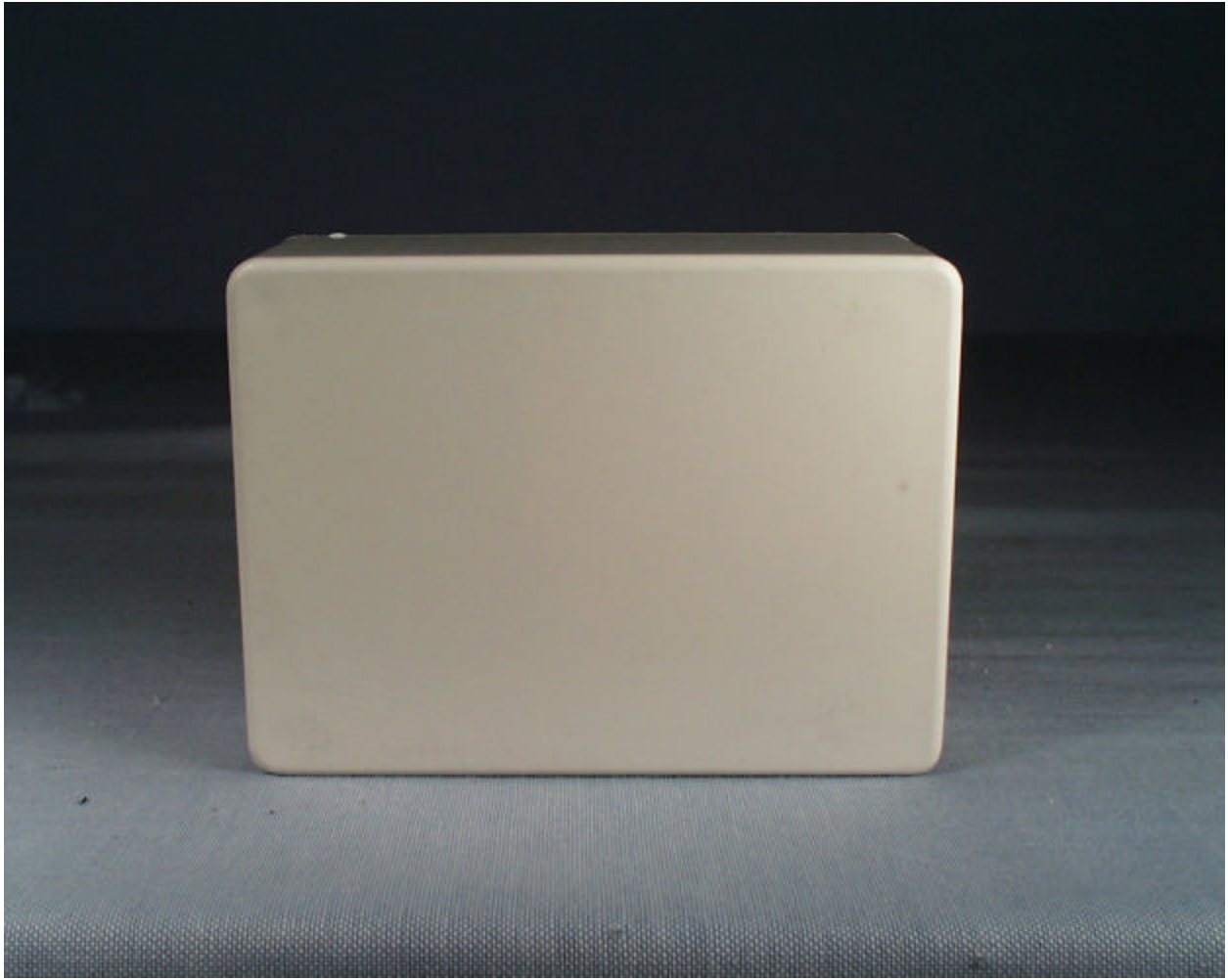
Front View of the NQE1005