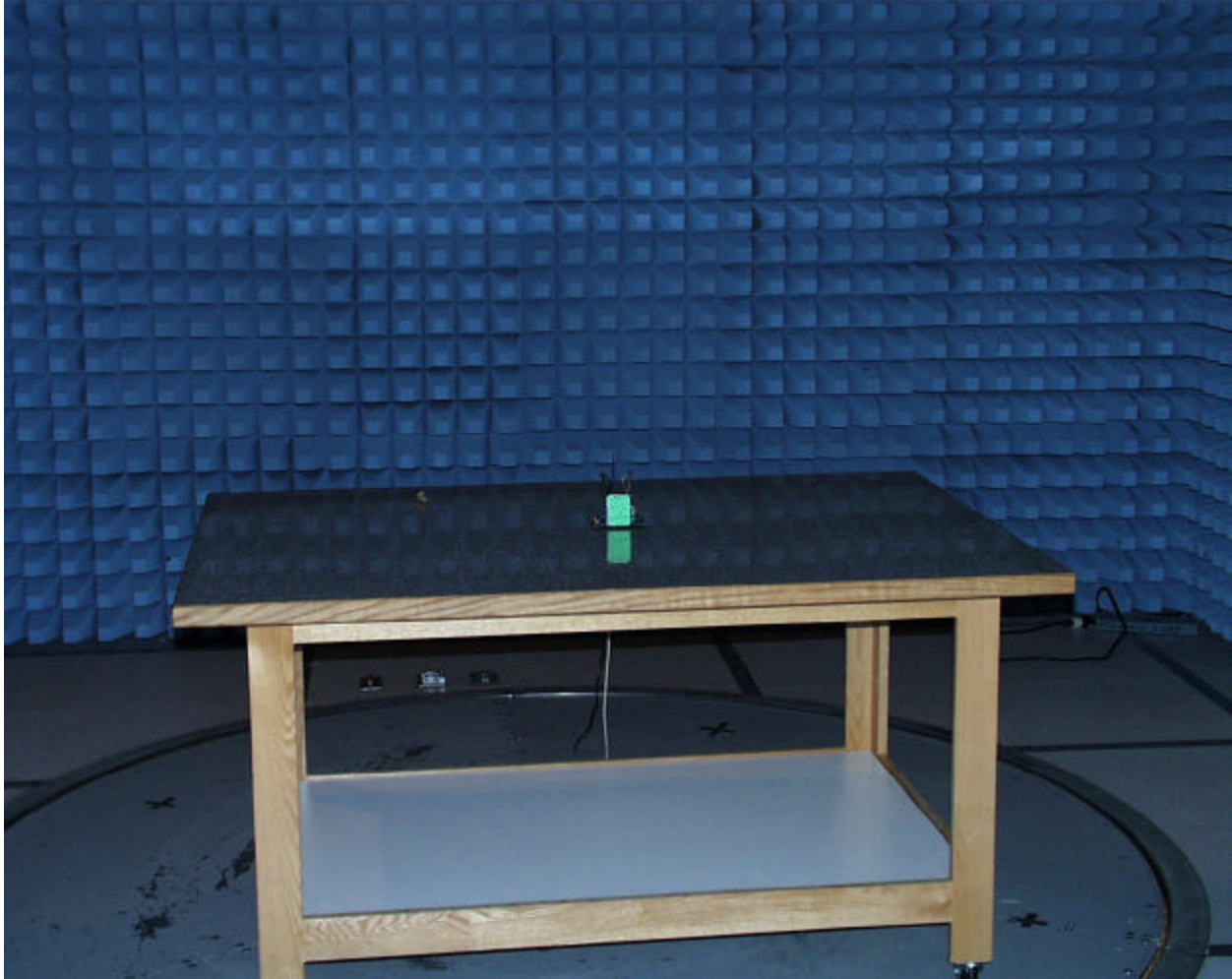
Worst case radiated emissions (Dipole antenna)