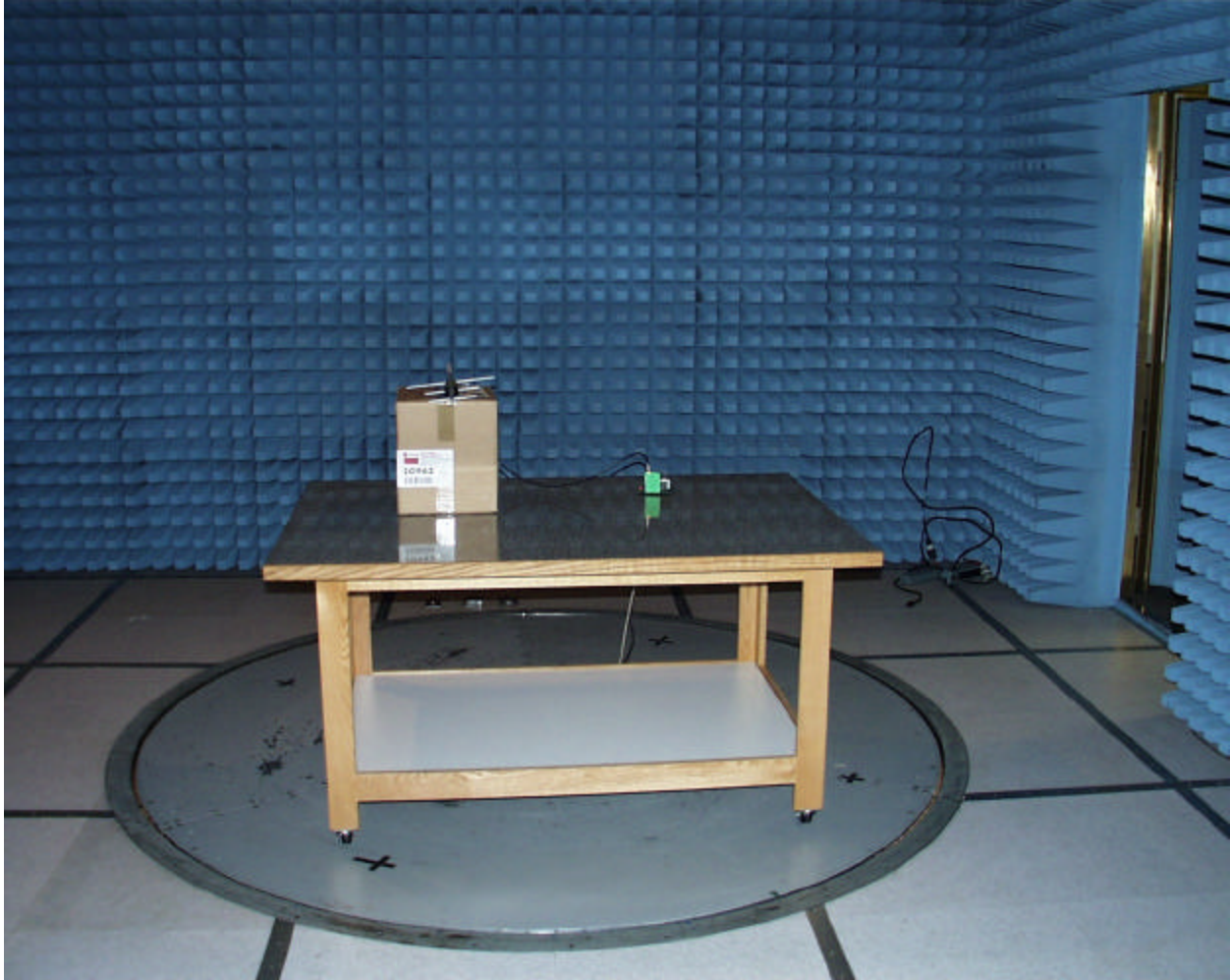
Worst case radiated emissions (Yagi antenna)