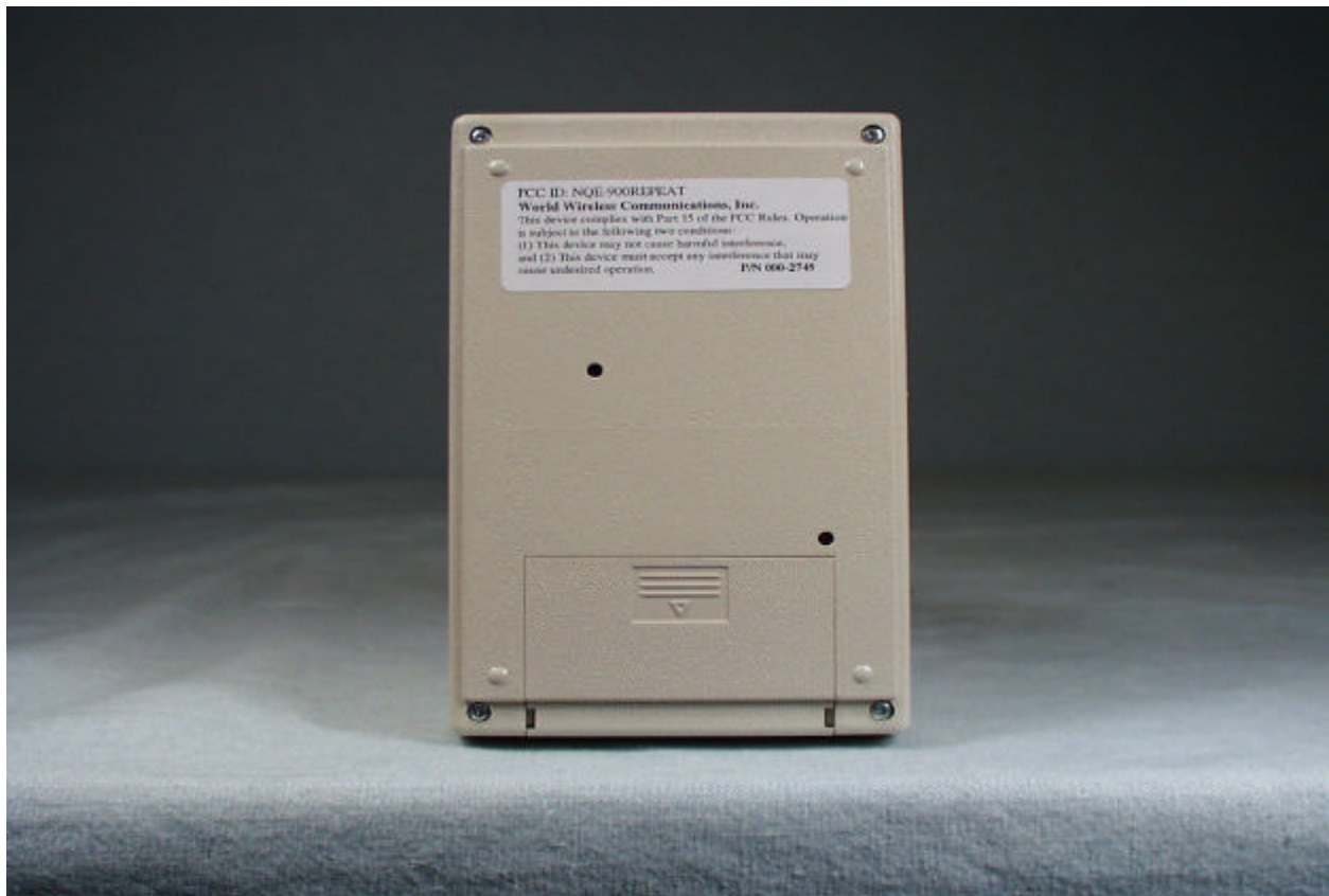
Photograph showing label placement