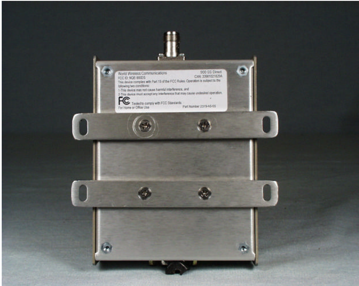
Photograph showing label placement