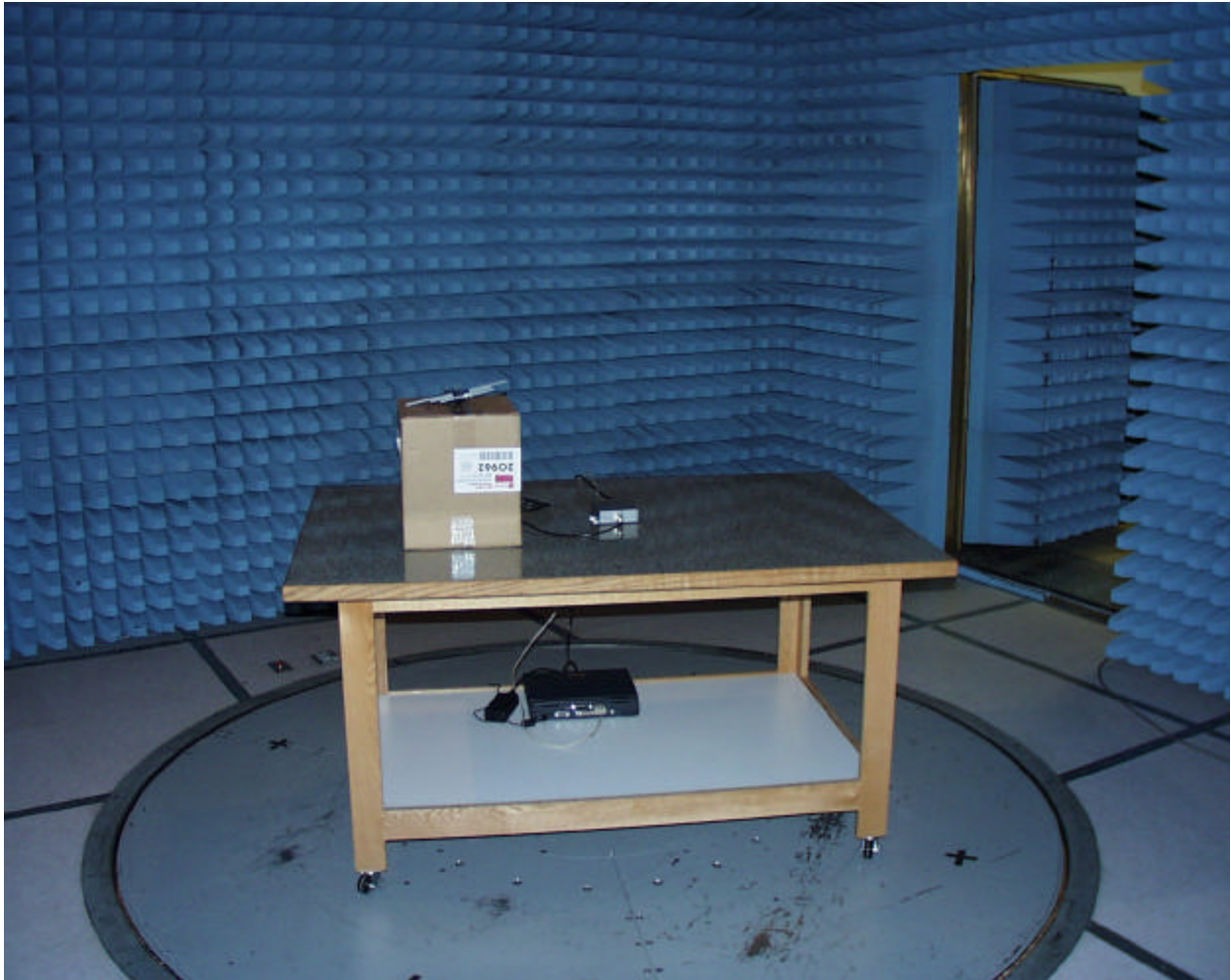
Worst case radiated emissions (Yagi antenna)