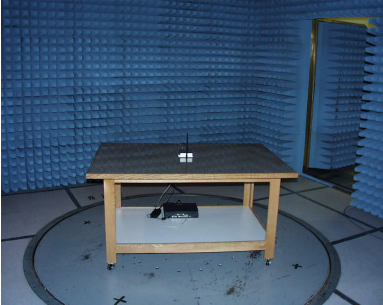
Worst case radiated emissions (Dipole antenna)