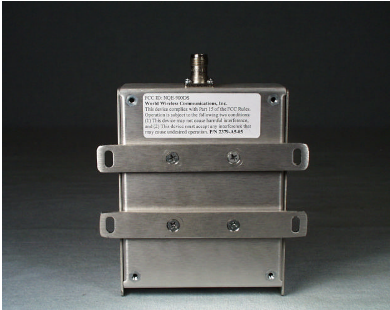
Photograph showing label placement