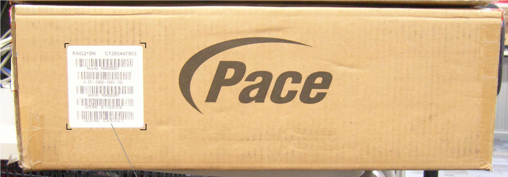
PositionShipping Carton label C139-RNG210N-Shipper-Label-RevA as squarely as possible in position shown.

LABEL POSITION INSTRUCTION FOR PACE RNG210N PARKER (C1393443200)