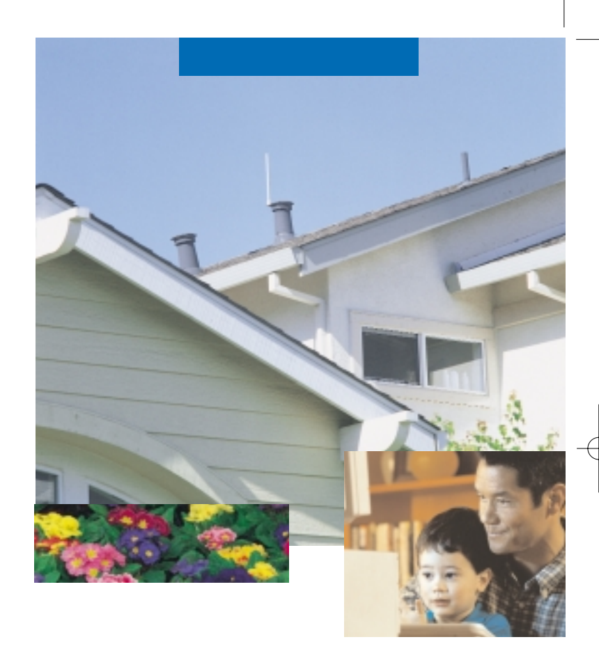
Wireless Router Subscriber Guide

This equipment must be installed by a professional installer.