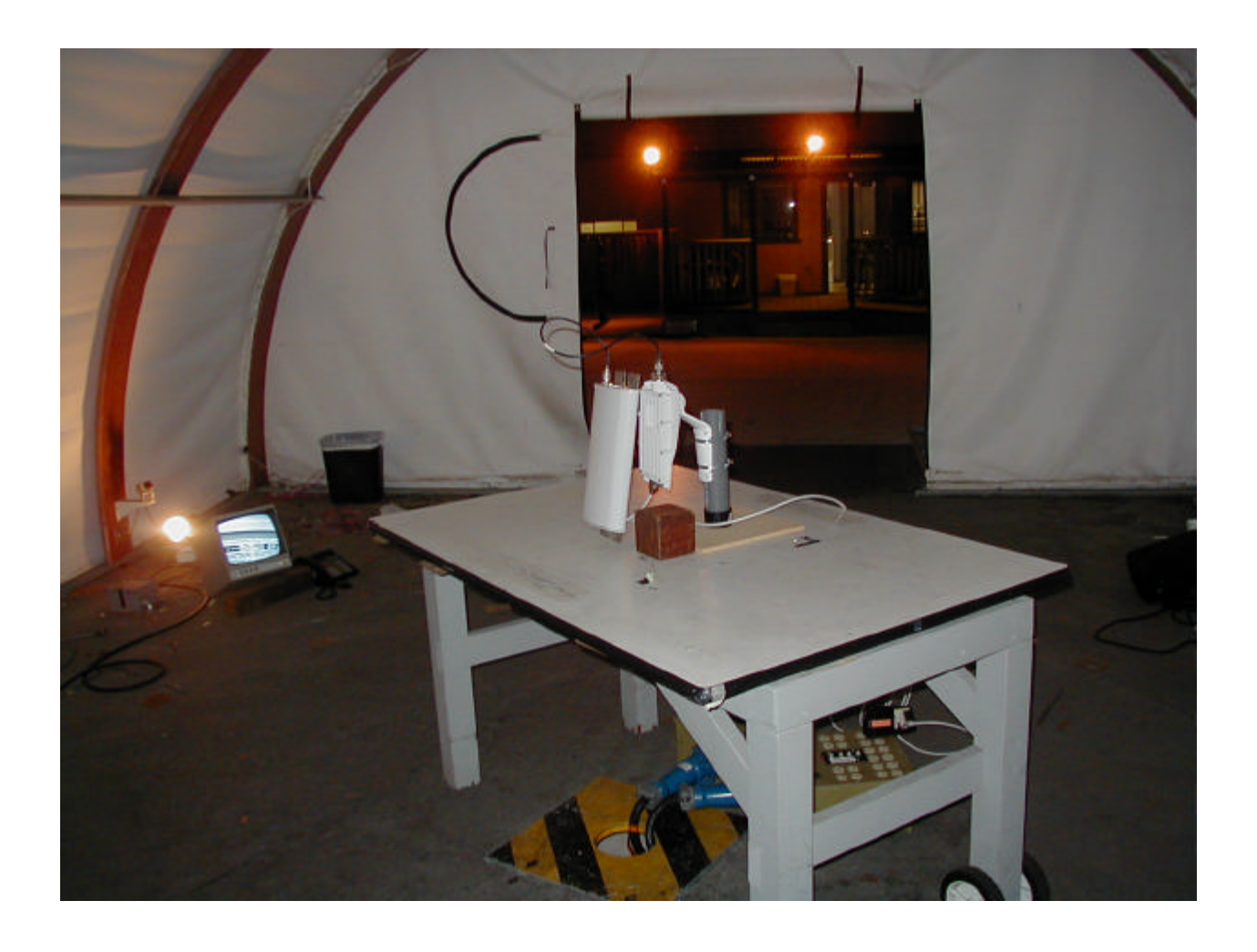
EXHIBIT 3: Radiated Emissions Test Configuration Photographs