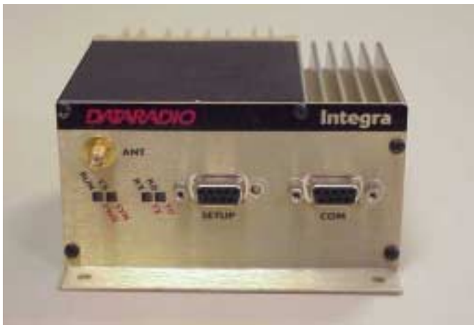
3. Back View