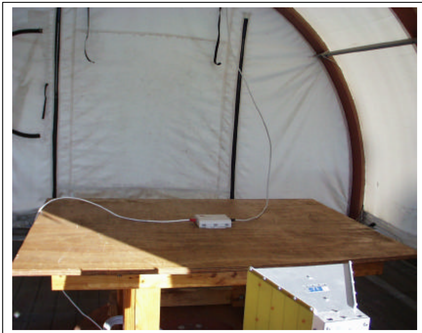
HARMONIC & SPURIOUS MEASUREMENTS (ABOVE 1GHz)