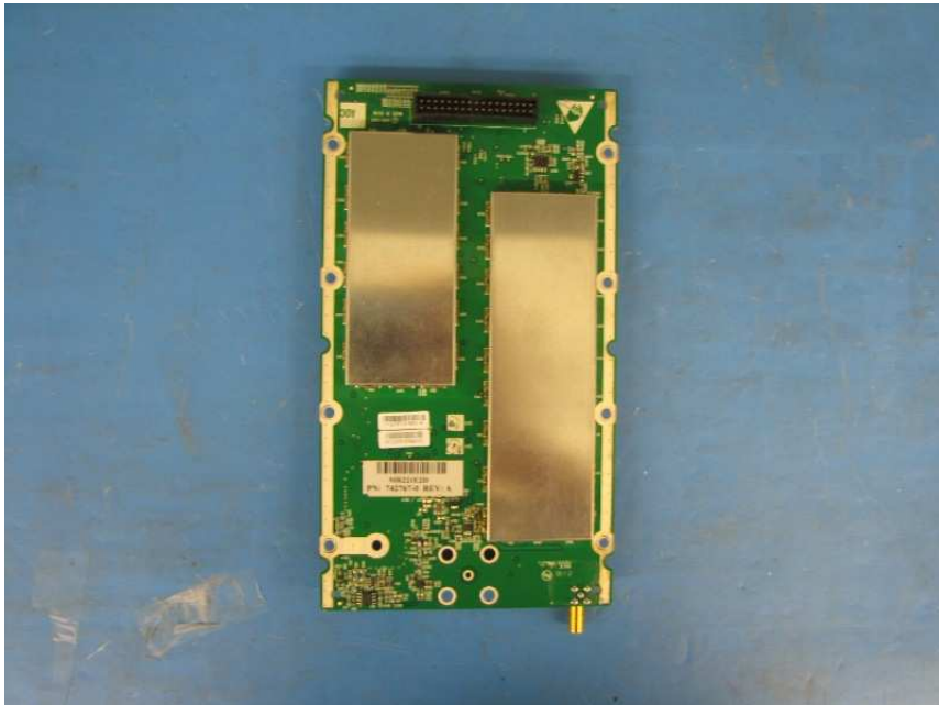
PCB Assembly Bottom View Ant Port with shielding – SRAU