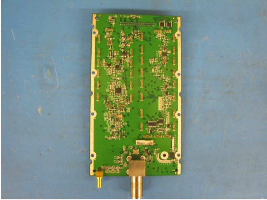
PCB Assembly Top View Ant Port without shielding - SRAU