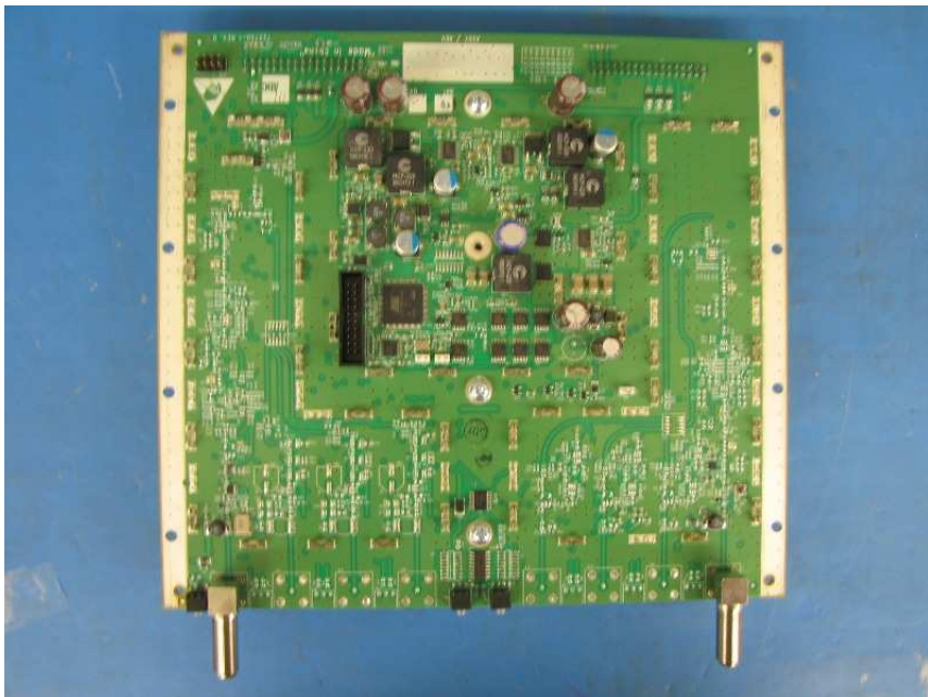
PCB IF Assembly Bottom View without shielding- SRAU