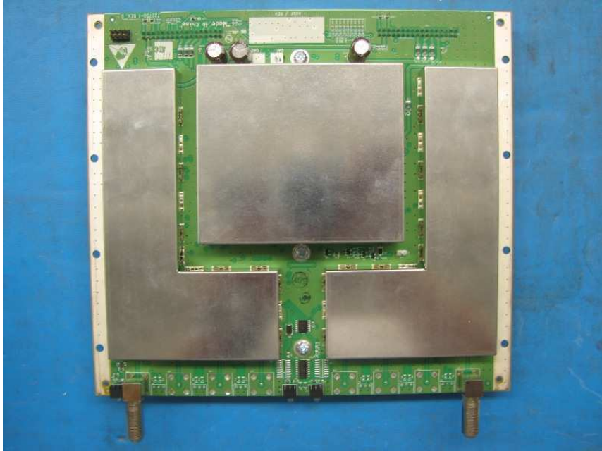
PCB IF Assembly Bottom View with shielding- SRAU