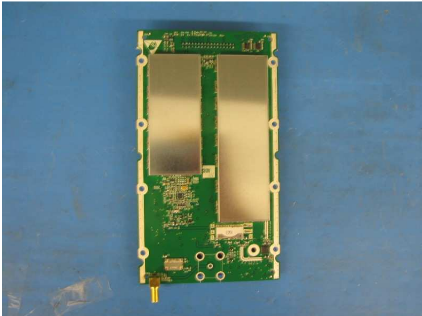
PCB Assembly Top View Ant Port with shielding - SRAU