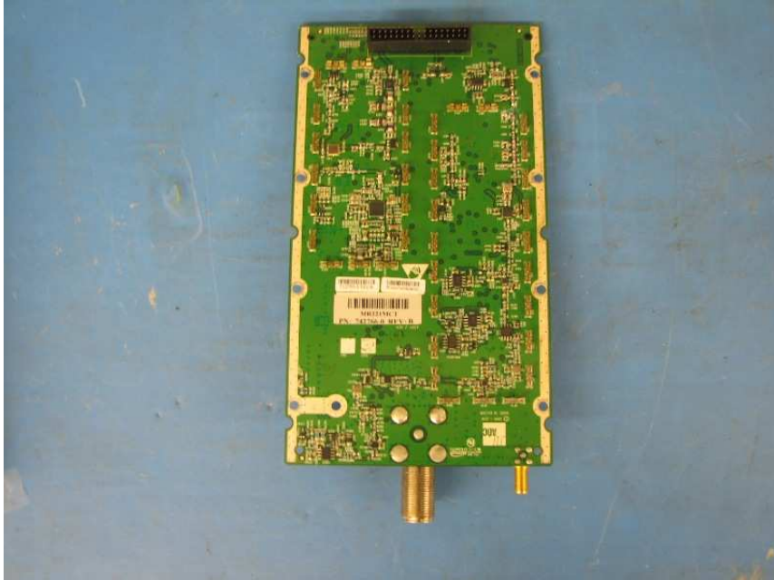
PCB Assembly Bottom View Ant Port without shielding – SRAU