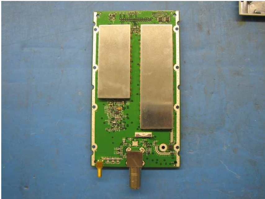
PCB Assembly Top View Ant Port with shielding - SRAU