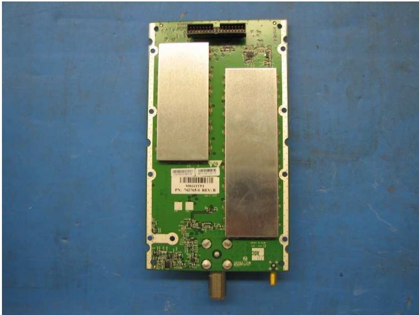
PCB Assembly Bottom View Ant Port with shielding – SRAU