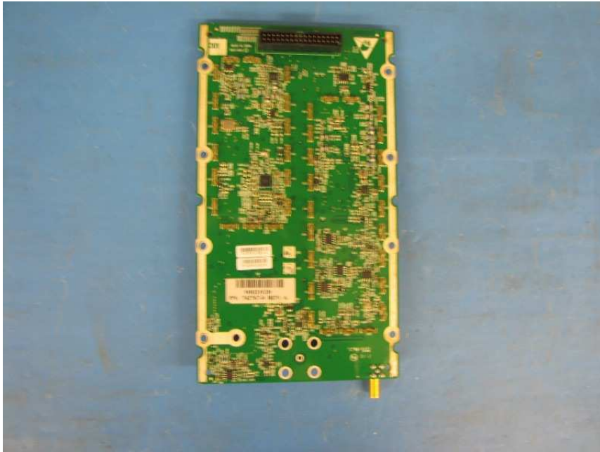
PCB Assembly Bottom View Ant Port without shielding – SRAU