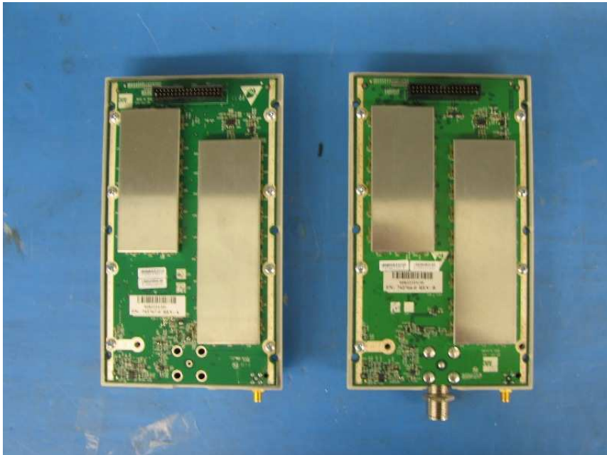
Internal Assembly 2