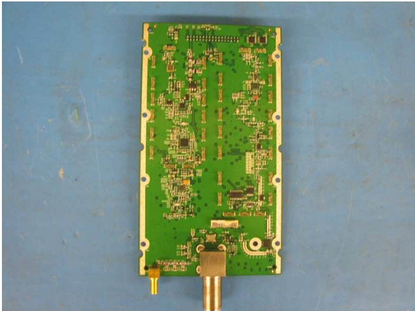
PCB Assembly Top View Ant Port without shielding - SRAU