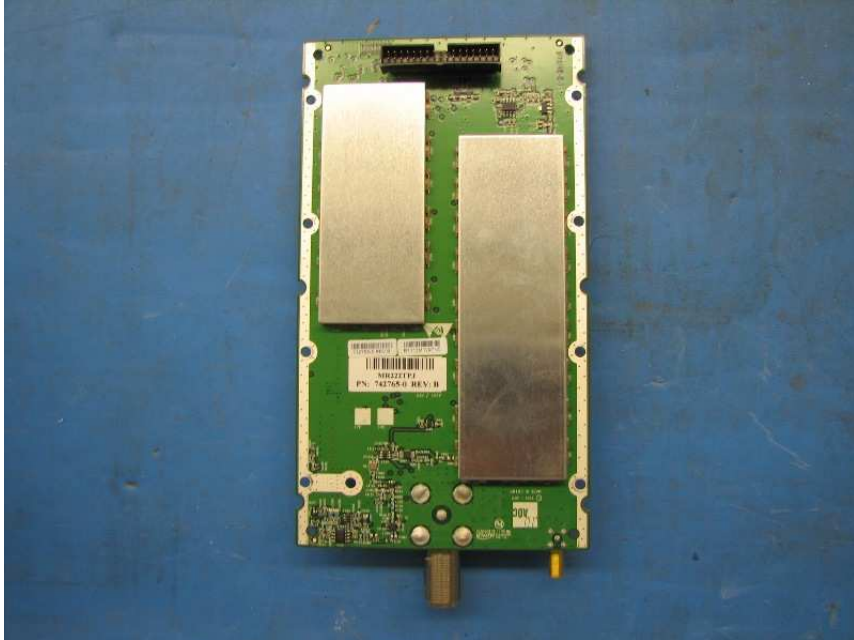
PCB Assembly Bottom View Ant Port with shielding – SRAU