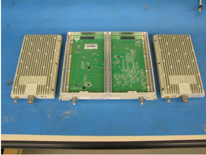
Internal Assembly 1