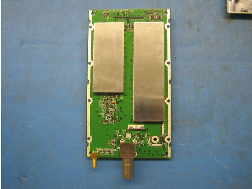
PCB Assembly Top View Ant Port with shielding - SRAU