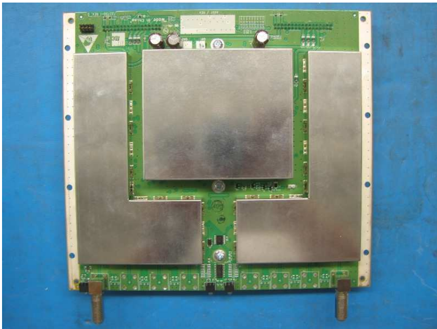
PCB IF Assembly Bottom View with shielding- SRAU