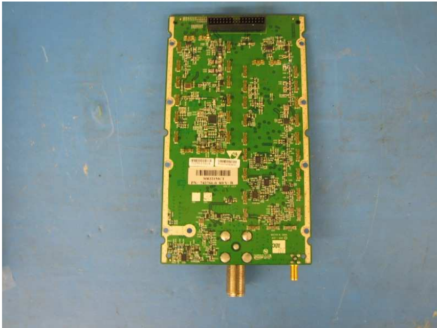
PCB Assembly Bottom View Ant Port without shielding – SRAU