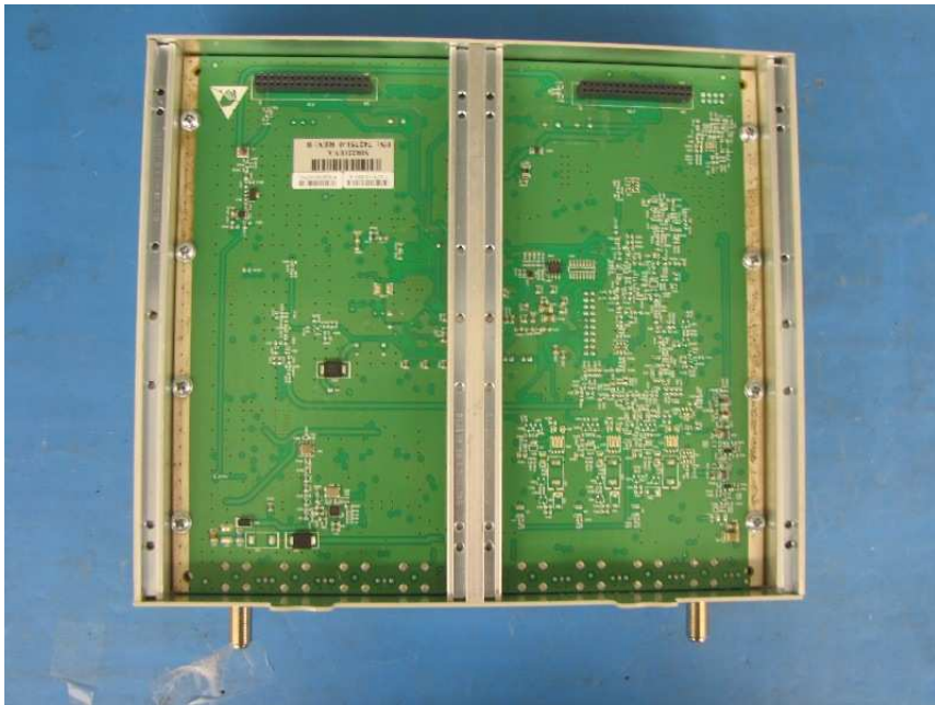
Internal Assembly 2