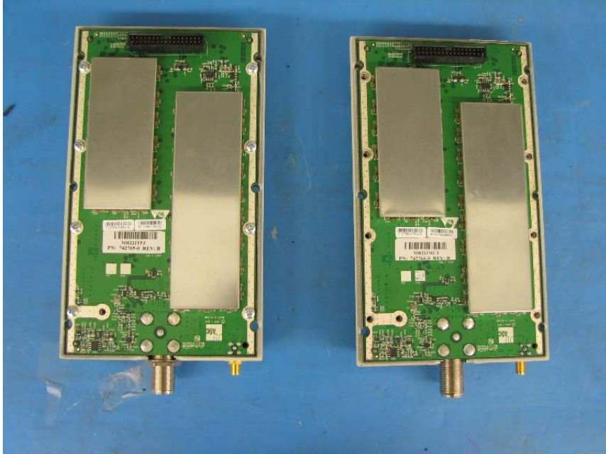
Internal Assembly 3