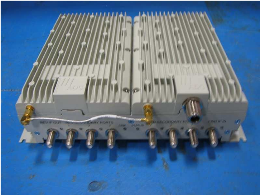
Front View 1