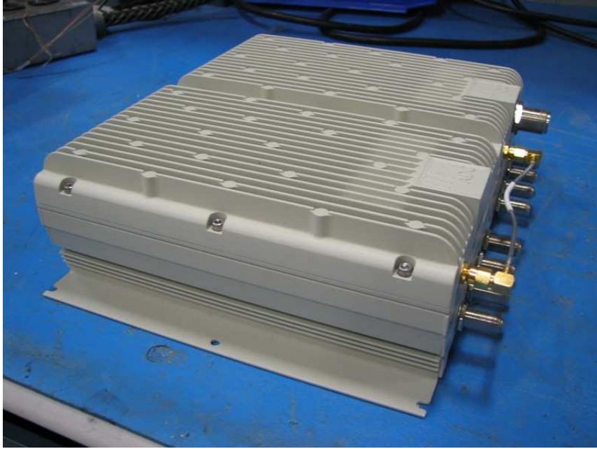
Side View 2