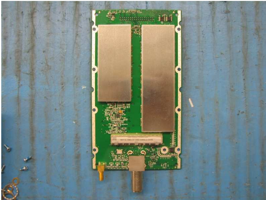
PCB Assembly Top View Ant Port with shielding - MRAU