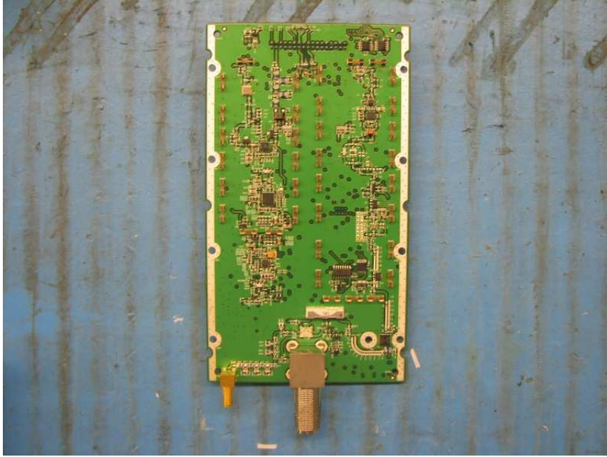
PCB Assembly Top View Ant Port without shielding - MRAU