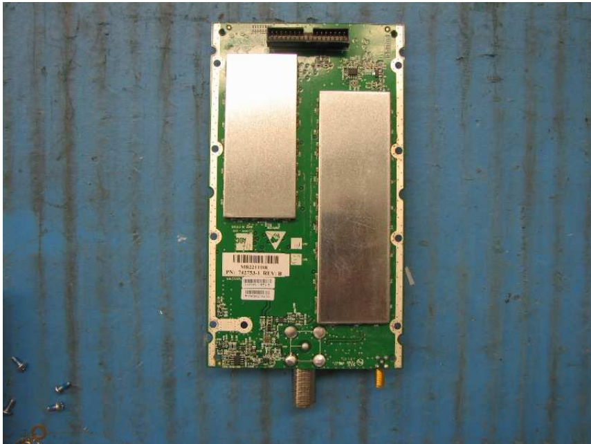
PCB Assembly Bottom View Ant Port with shielding – MRAU