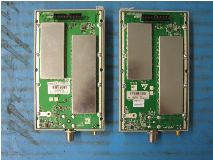
Internal Assembly 2