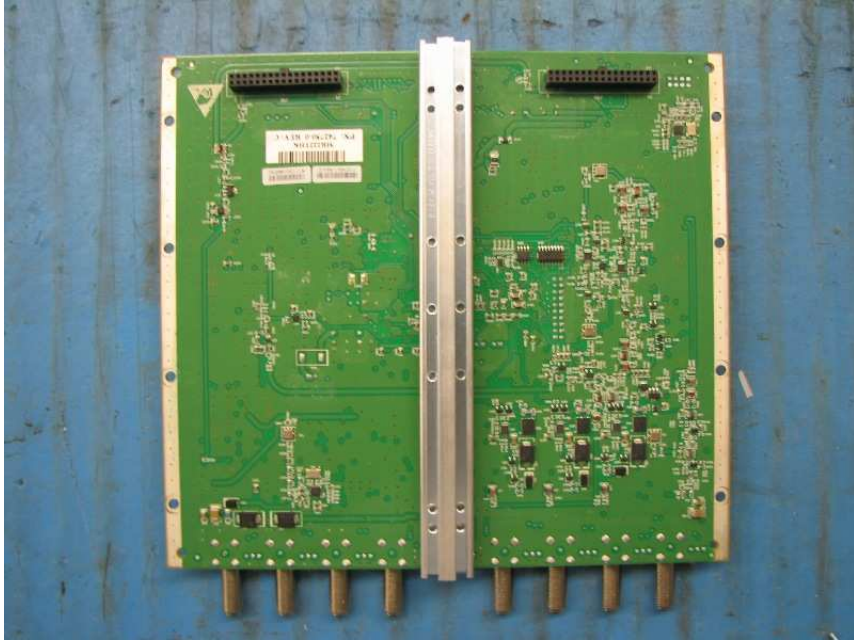
PCB IF Assembly Top View - MRAU