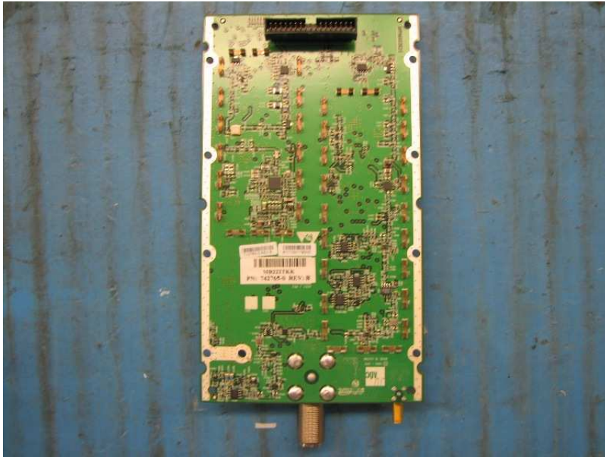
PCB Assembly Bottom View Ant Port without shielding – MRAU