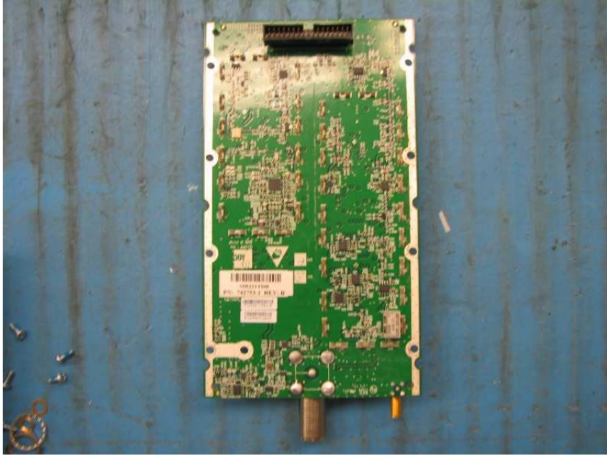
PCB Assembly Bottom View Ant Port without shielding – MRAU