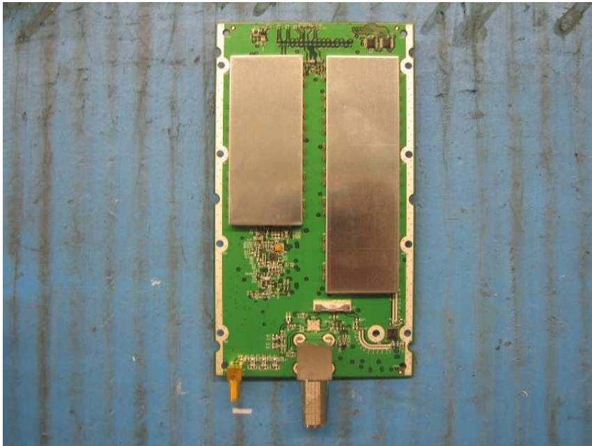
PCB Assembly Top View Ant Port with shielding - MRAU