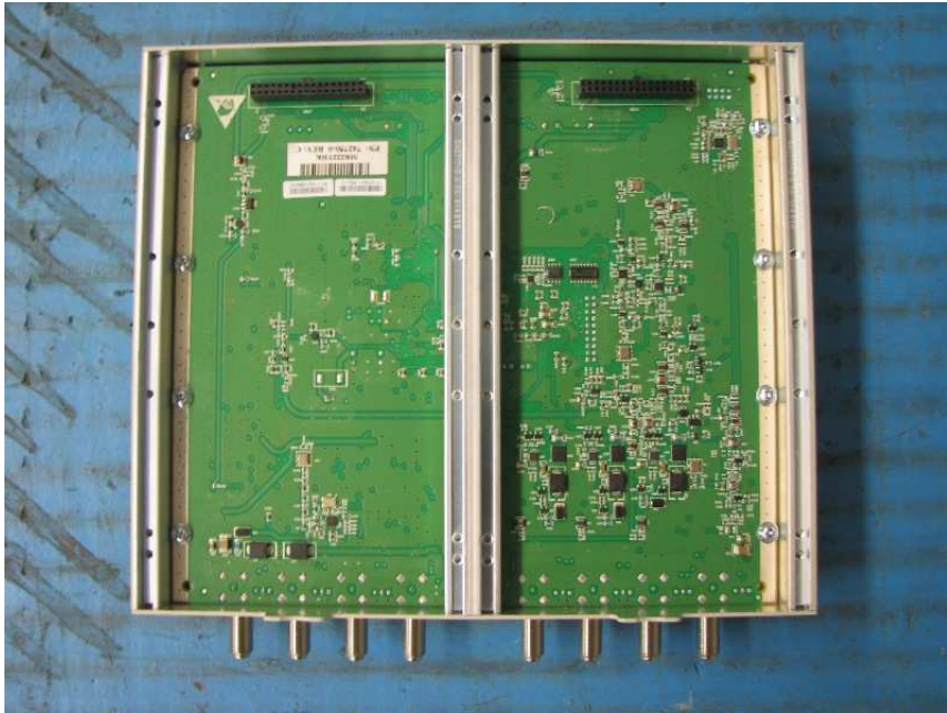
Internal Assembly 1