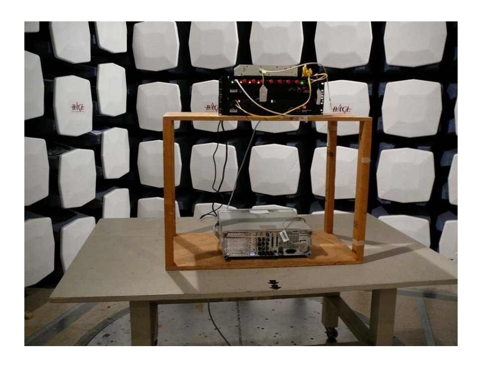
Radiated Emissions 30 MHz to 1 GHz- Rear View