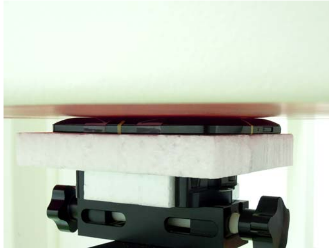
Rear Face of EUT with 0 cm Gap