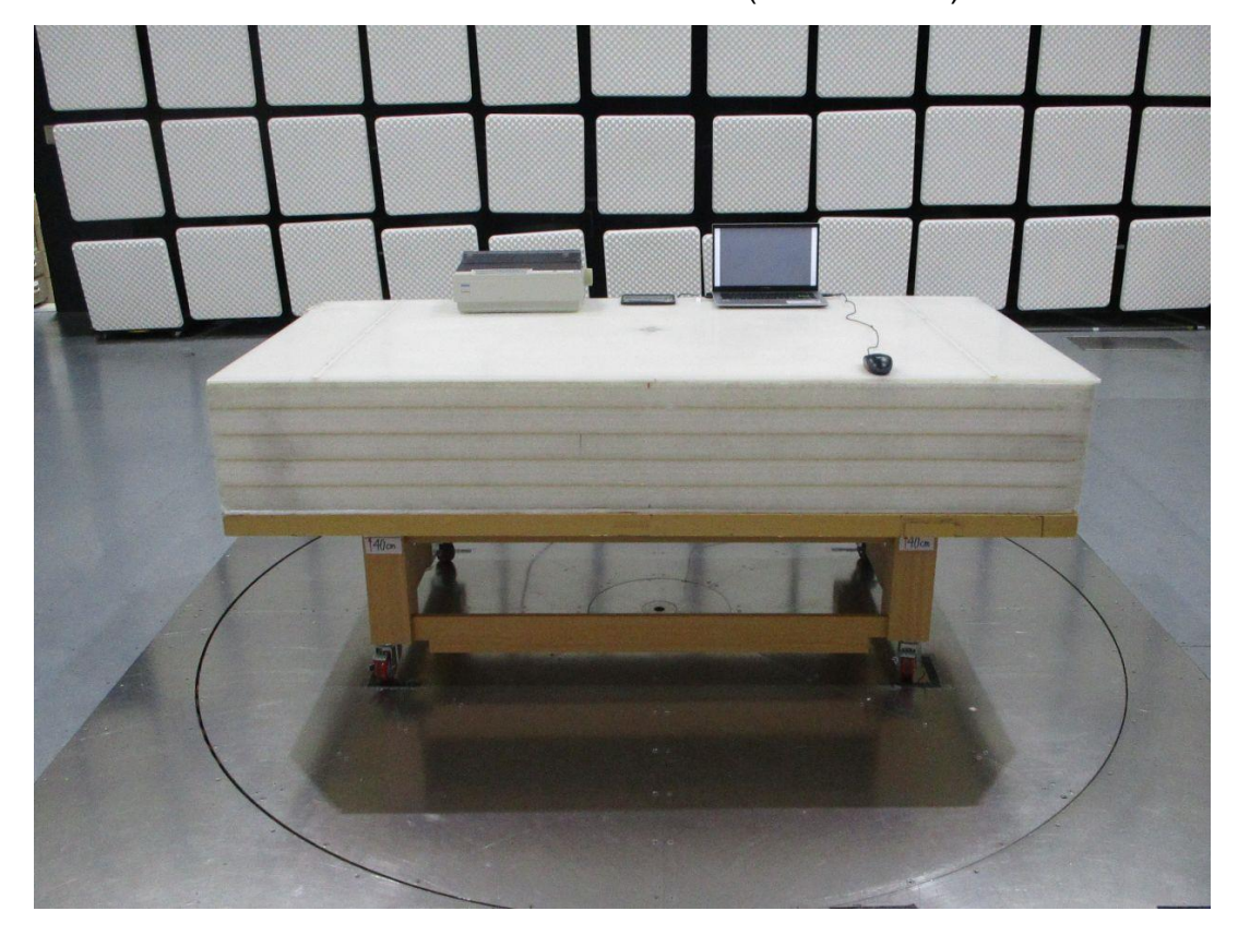
RADIATED EMISSION TEST (Below 1GHz)